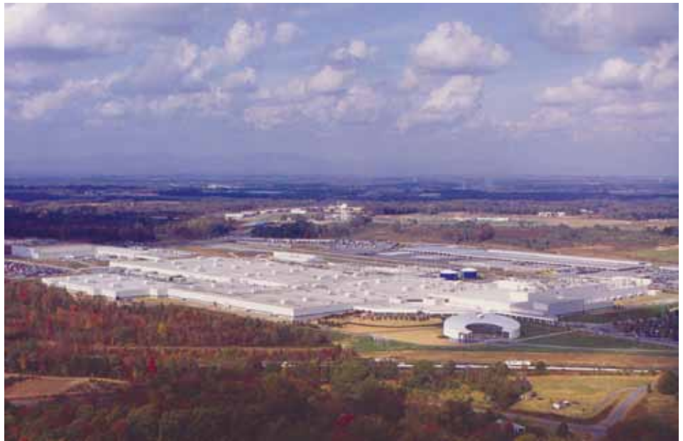
The sprawling Spartanburg plant in South Carolina has been a huge success for BMW. The crescent-shaped building in the foreground is the Zentrum, the American branch of the BMW Museum.