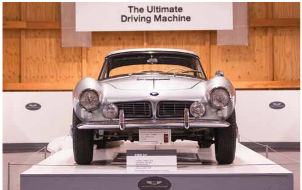
This 507 has been owned for years by the family of the Chairman of the Board of the LeMay Museum Trust.