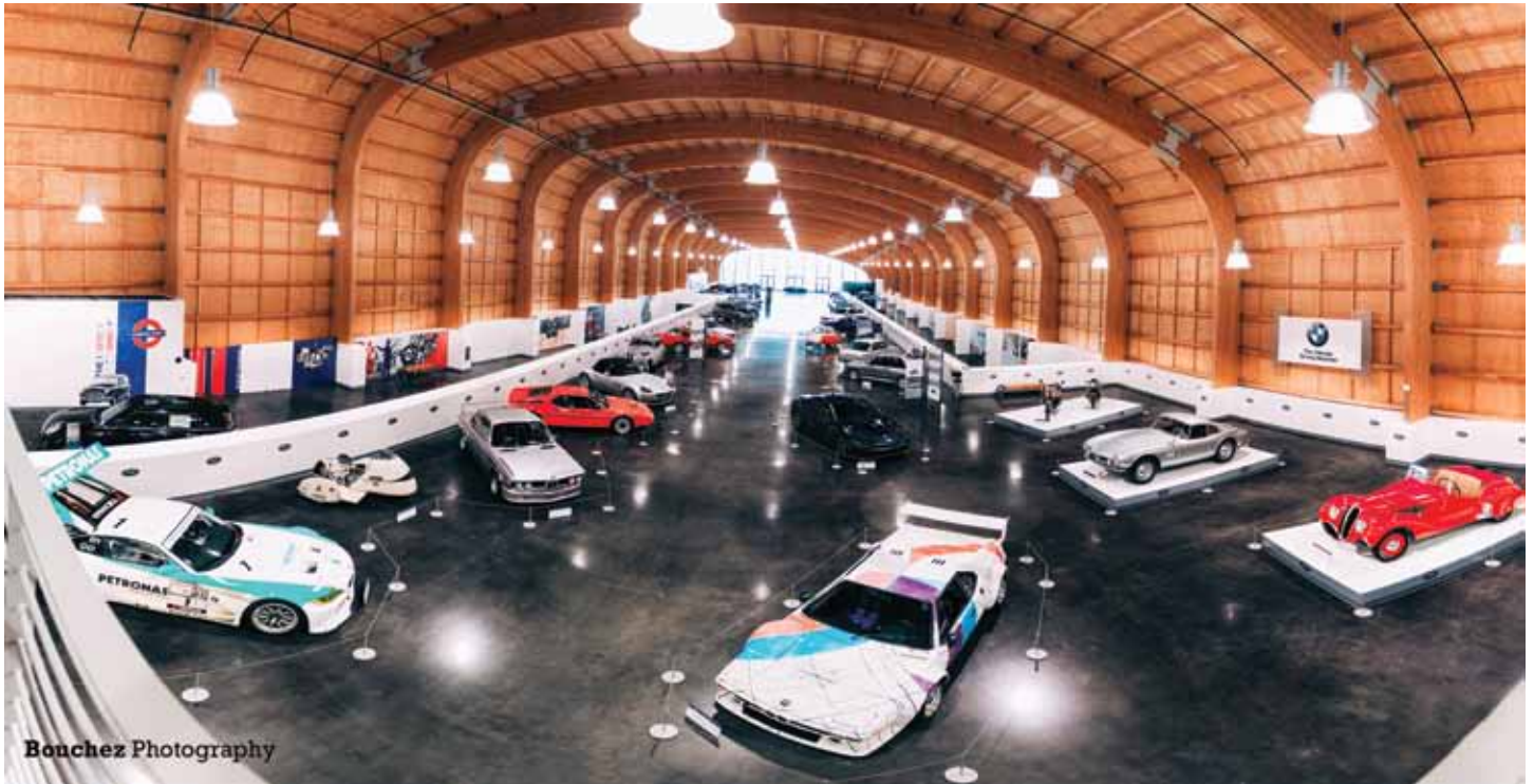
The full exhibit space with the Stella Art Car front and center.