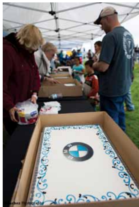
The Cake Cutters served 400 pieces of roundel cake.