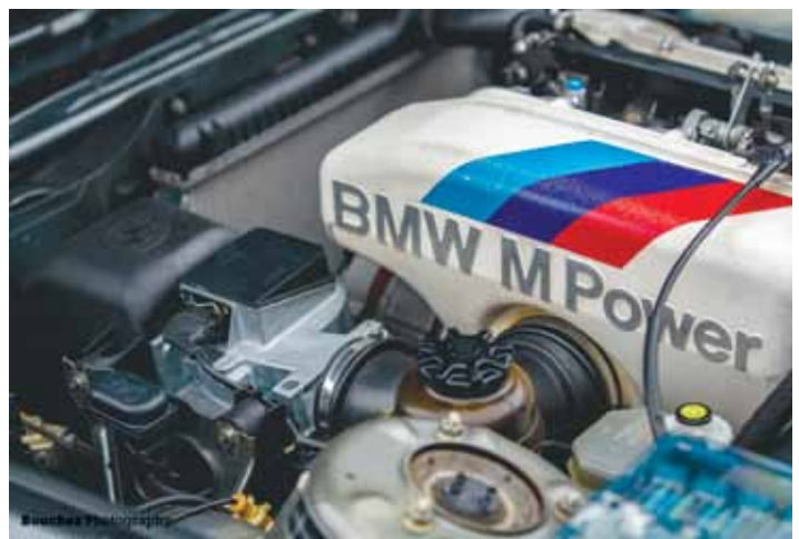
We had enough power on the lawn to light up Tacoma.