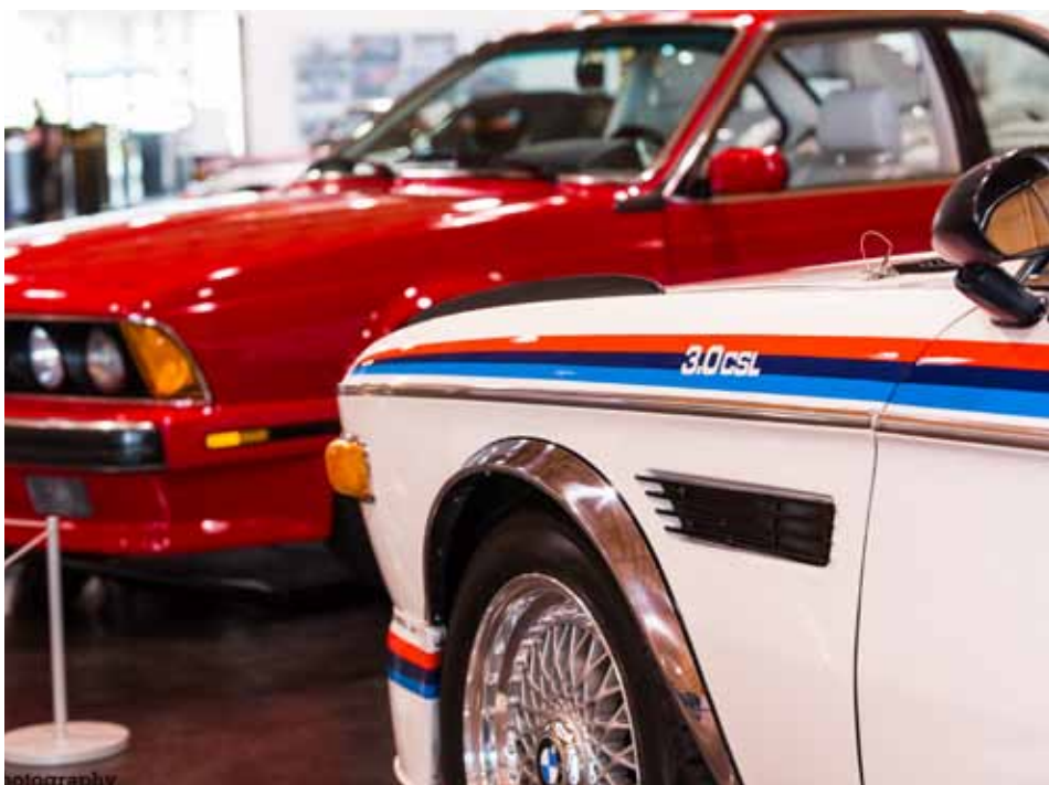
Two generations of beautiful coupes.