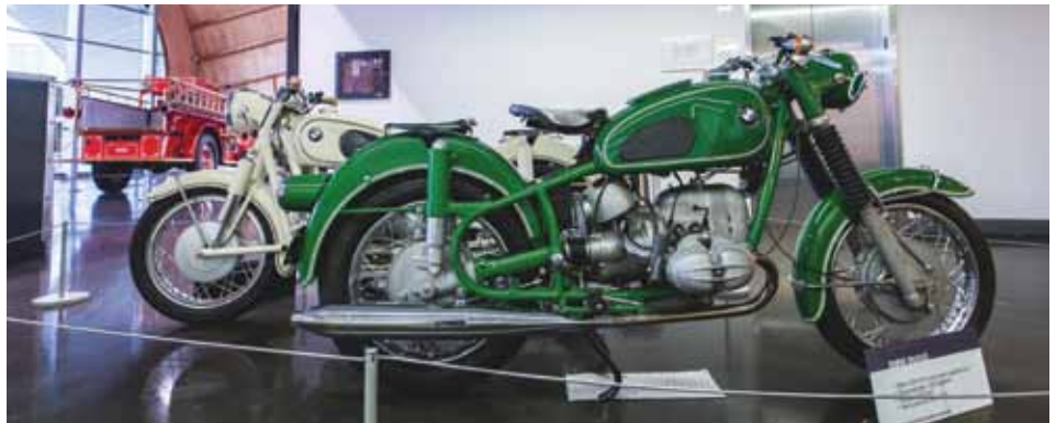
The exhibit also includes some nice Beemers.