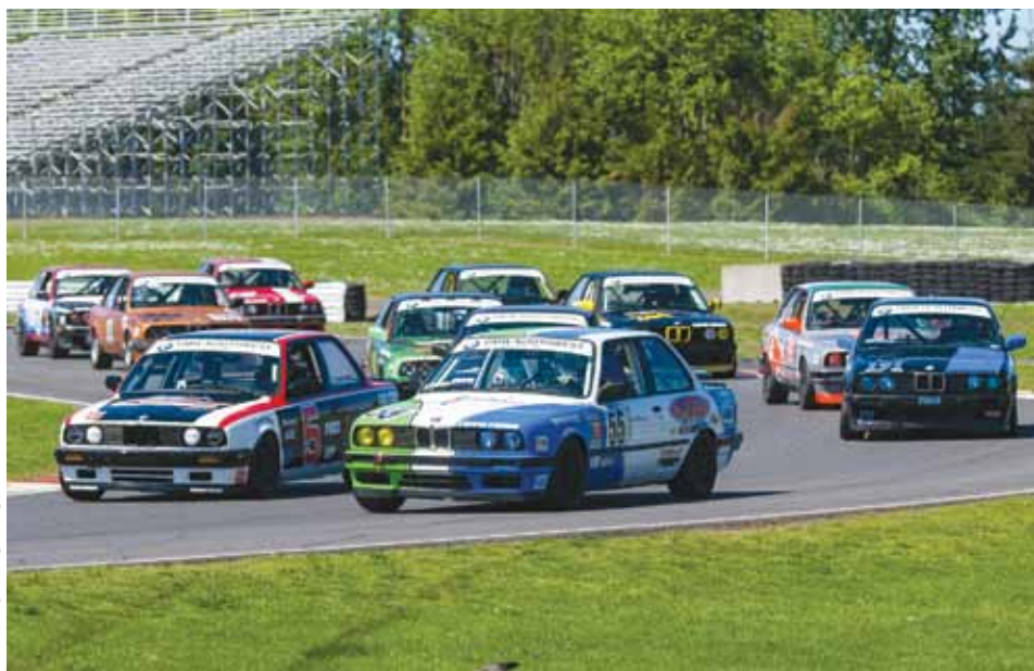
The PRO3 grid enters the first corner at Portland.