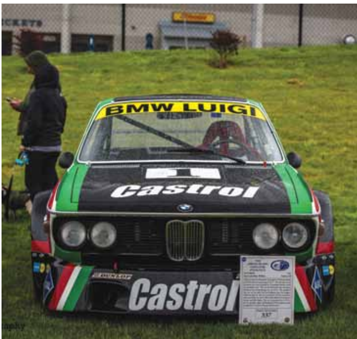
This famous Luigi Batmobile was European Touring Car Champion in 1976 and runner up in 1977.

Fittingly for such an occasion, we had special event hats, posters, window clings, refrigerator magnets and tote bags to hold it all. Extremely popular was the birthday cake which was served. We had four cakes, each providing 100 pieces and each with an oversize Roundel emblem. Six volunteers with prior cake-cutting experience—this was no place for novices—served 400 pieces of cake in very short order. This precision operation was a sight to behold.