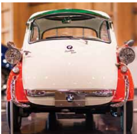
The little Isetta was built from 1955 to 1962. The single door opens in the front.