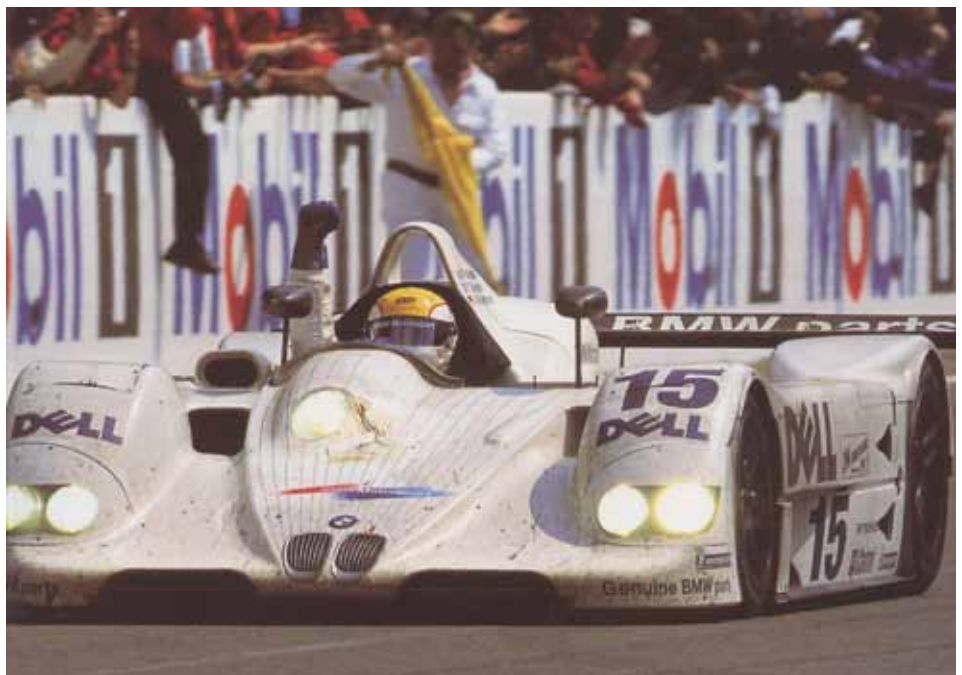
This car won the 24 Hour of Le Mans in 1999.