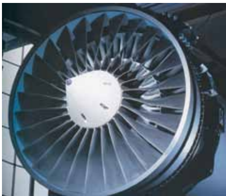
A product of the short-lived BMW-Rolls-Royce joint venture that produced jet engines.

Also in 1990, BMW formed a joint venture with Rolls-Royce PLC to build airplane engines, thus getting back to the company's origins. Some of BMW's adventures during the 1990s did not work out well and this was one. By 1999, BMW sold its shares to Rolls-Royce PLC and exited the airplane engines business, again.