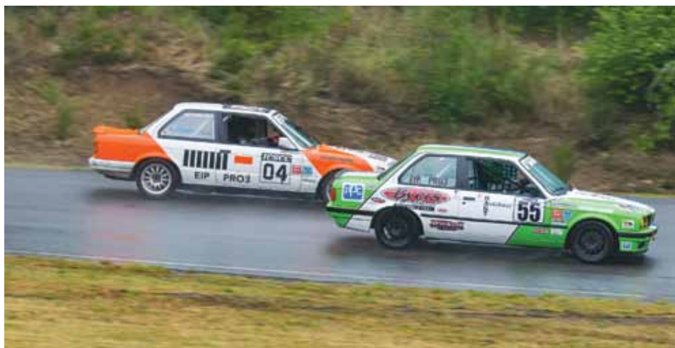
The close racing that is found throughout the grid.