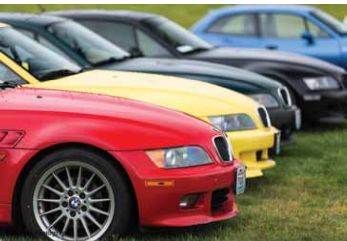
This colorful group of Z3/Z4 coupes managed to gather together.