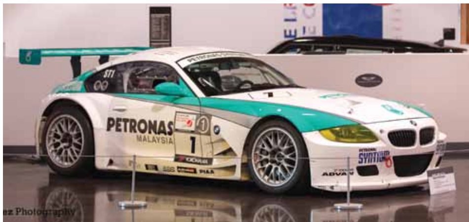
The Z4M was the last generation of BMW's customer racing car. This car was purchased directly from Petronas.