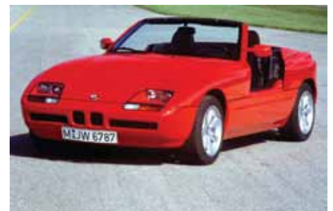
The Z1 with its drop-down doors is a rare sight in America.

The mid-1980s brought the now legendary E30 M3, the most successful touring car in history. BMW Technik was founded in 1985 to explore new technologies. Their first product was the Z1 sports car with an aluminum chassis, plastic body panels and drop-down doors.