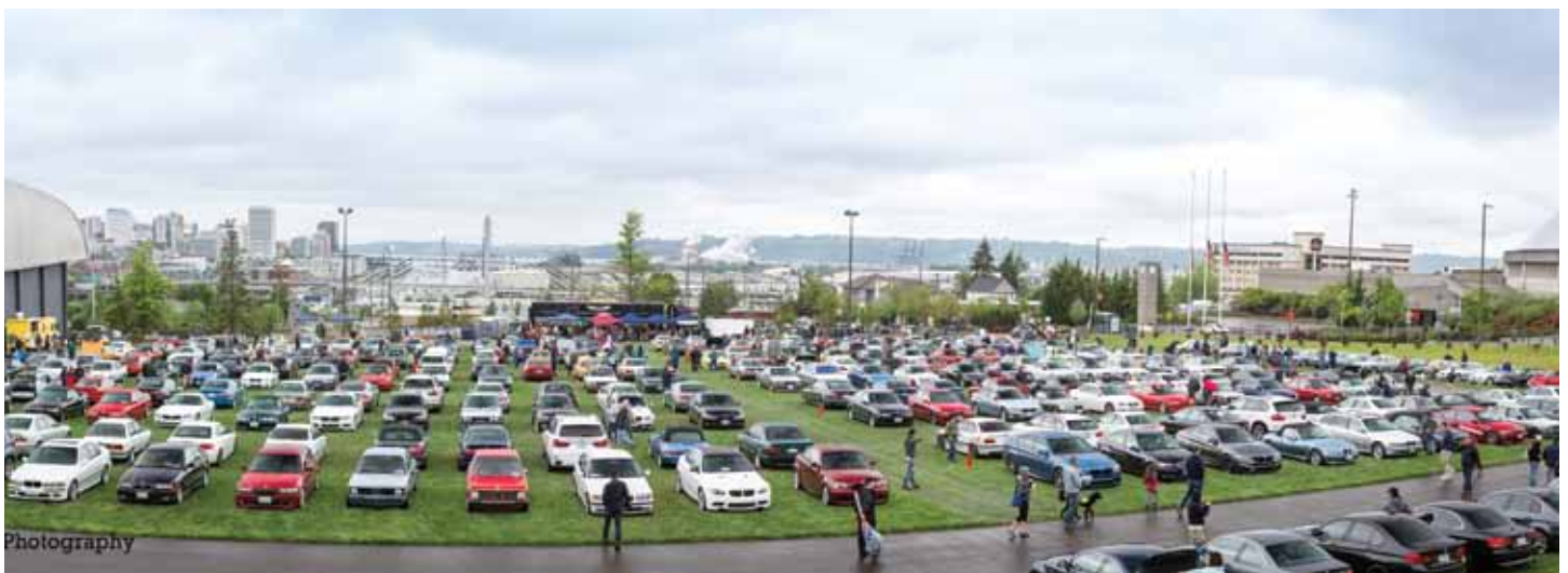
This 'Field of Dreams' provides an idea of the scope of the event.