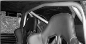
BMW 2002 Sparco DTM seats & Speedware fabricated roll bar

DIAGNOSTIC REPAIRS CHIP UPGRADES TURBO UPGRADES SUSPENSION INSTALLATIONS COMPUTERIZED CORNER BALANCING SEAT BRACKET FABRICATION CUSTOM EXHAUST FABRICATION COMPUTERIZED LASER ALIGNMENTS WHEEL & TIRE SERVICE ROLLCAGE DESIGN & FABRICATION SEAT INSTALLATION BRAKES IN HOUSE COMPLETE CAD DESIGN SYSTEMS