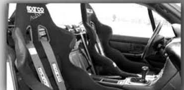
BMW M Coupe Speedware harness bar seat brackets belts seats all by Speedware

DIAGNOSTIC REPAIRS CHIP UPGRADES TURBO UPGRADES SUSPENSION INSTALLATIONS COMPUTERIZED CORNER BALANCING SEAT BRACKET FABRICATION CUSTOM EXHAUST FABRICATION COMPUTERIZED LASER ALIGNMENTS WHEEL & TIRE SERVICE ROLLCAGE DESIGN & FABRICATION SEAT INSTALLATION BRAKES IN HOUSE COMPLETE CAD DESIGN SYSTEMS