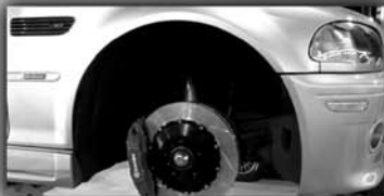
BMW M-3 Brembo brake kit & installation