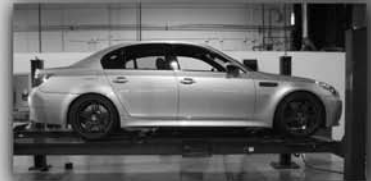
BMW M-5 KW coil overs/custom black 19" HRE's full chassis set up by Speedware