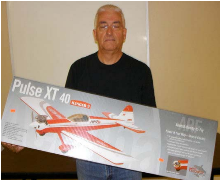
The meeting adjourned at 9:10 p.m.