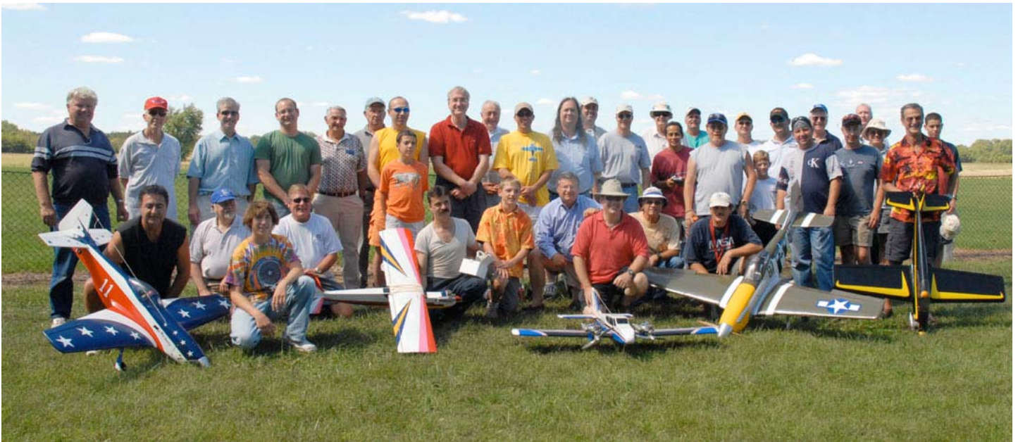
Club Members lined up for a nice class reunion Portrait