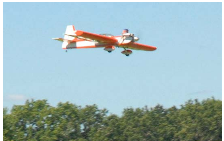
Egg Drop contestants in the Fun-Fly.

For more picnic pictures see the Bluemax web site at http://www.bluemaxrc.com/photogallery/photos.aspx?album=23