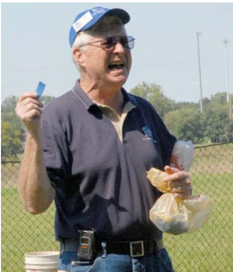
Jim calls out the raffle winners