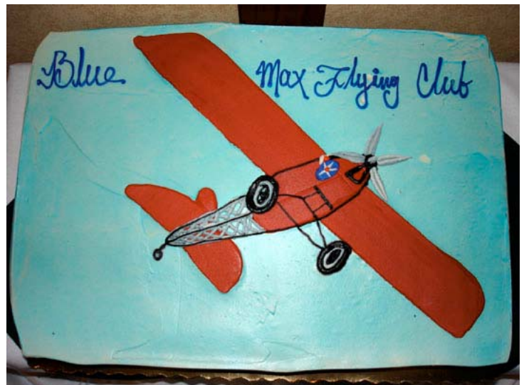
Dessert from Deerfield Bakery