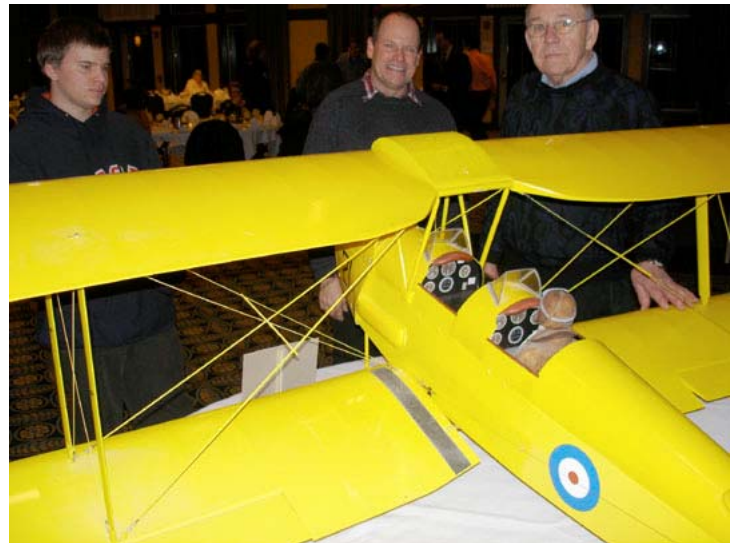
Rudy's Tiger Moth