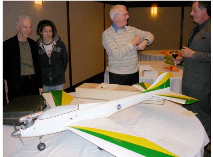
Frank's Pattern Ship