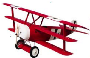
Fun-Fly July 17, Aerobatics.