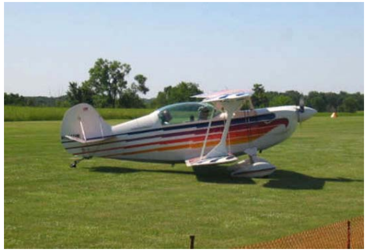
100% Christen Eagle