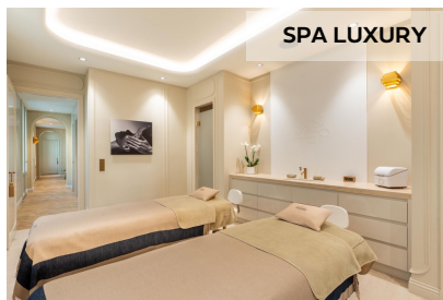
LUXURY & AMO TECHNICAL PROJECTS