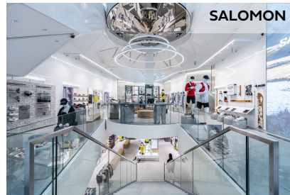
FLAGSHIP & CONSUMER EXPERIENCE