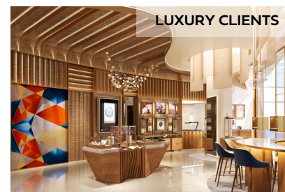
PHOTOREALISTIC 3D DRAWINGS