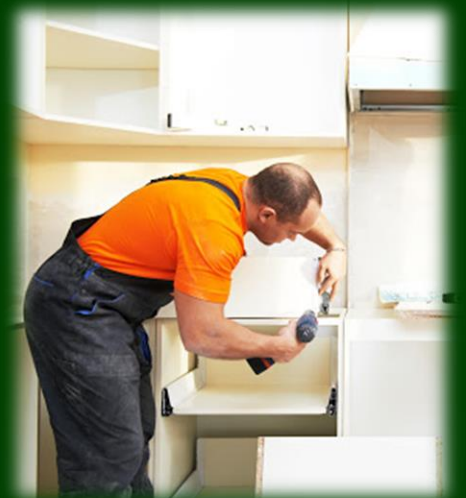
Production, delivery & installation