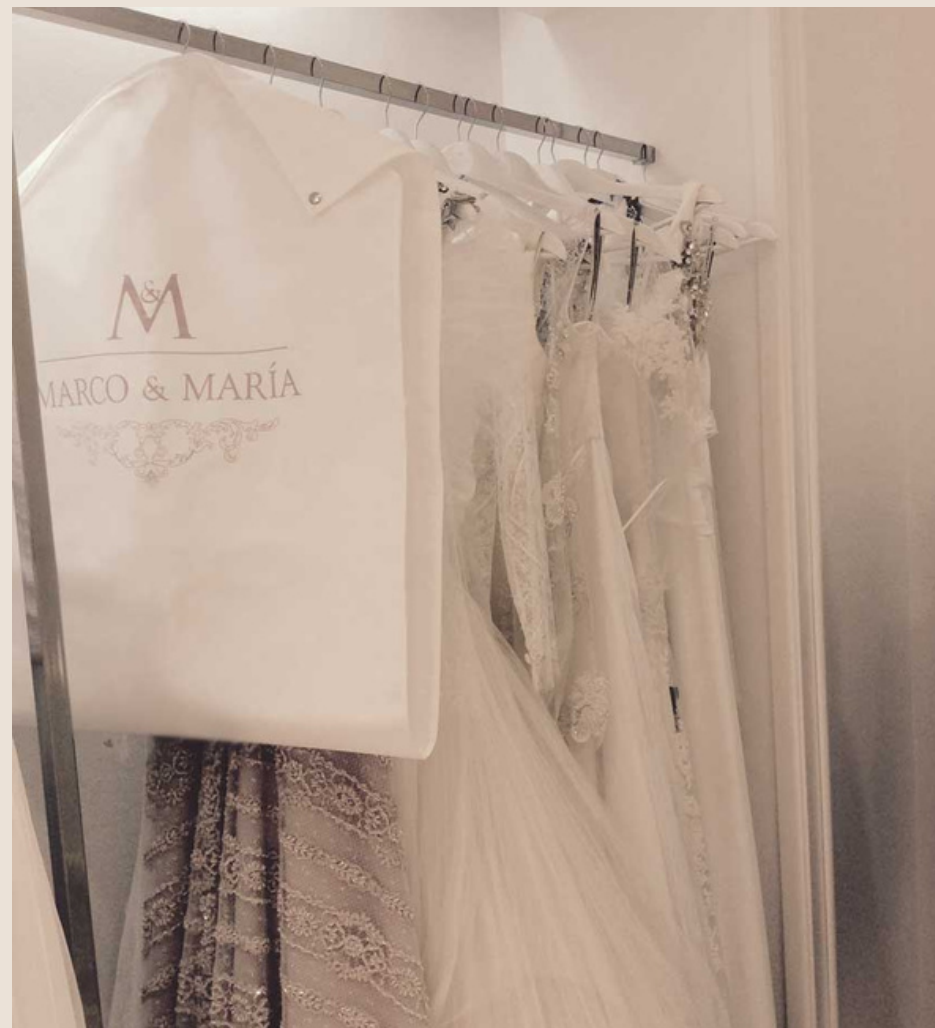
Garment storage both in cotton and recycled fabric.