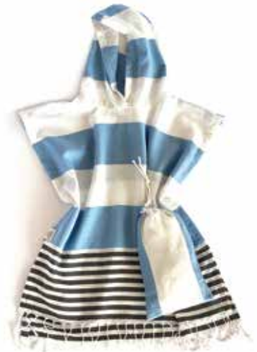
Light Blue - Black