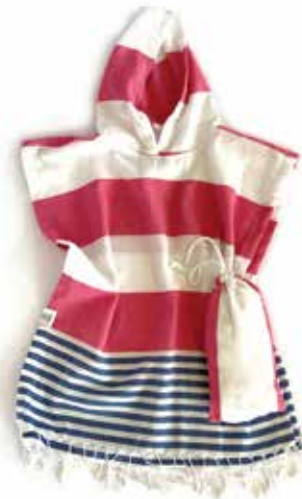
Pink - Blue