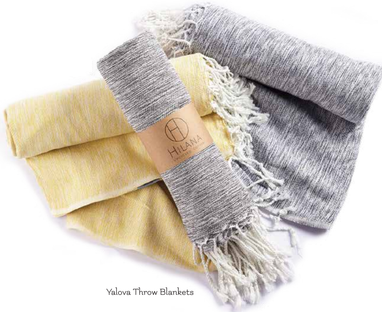
Yalova Throw Blankets