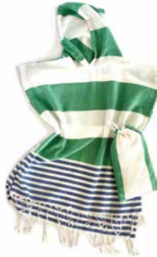
Green - Blue