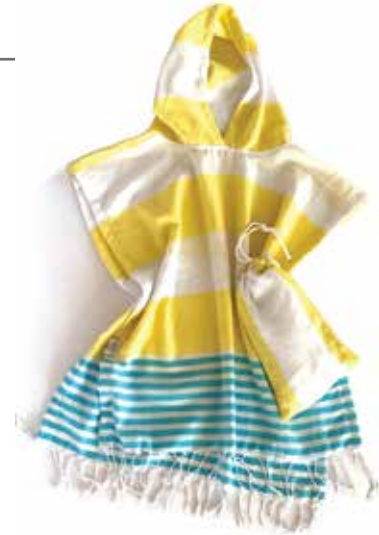
Yellow - Turquoise