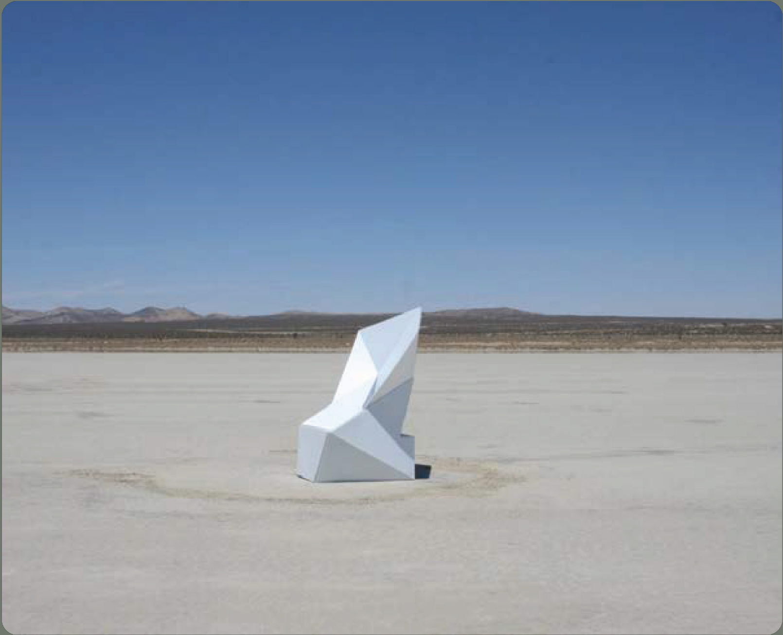
INNOVATION Our way of THINKING