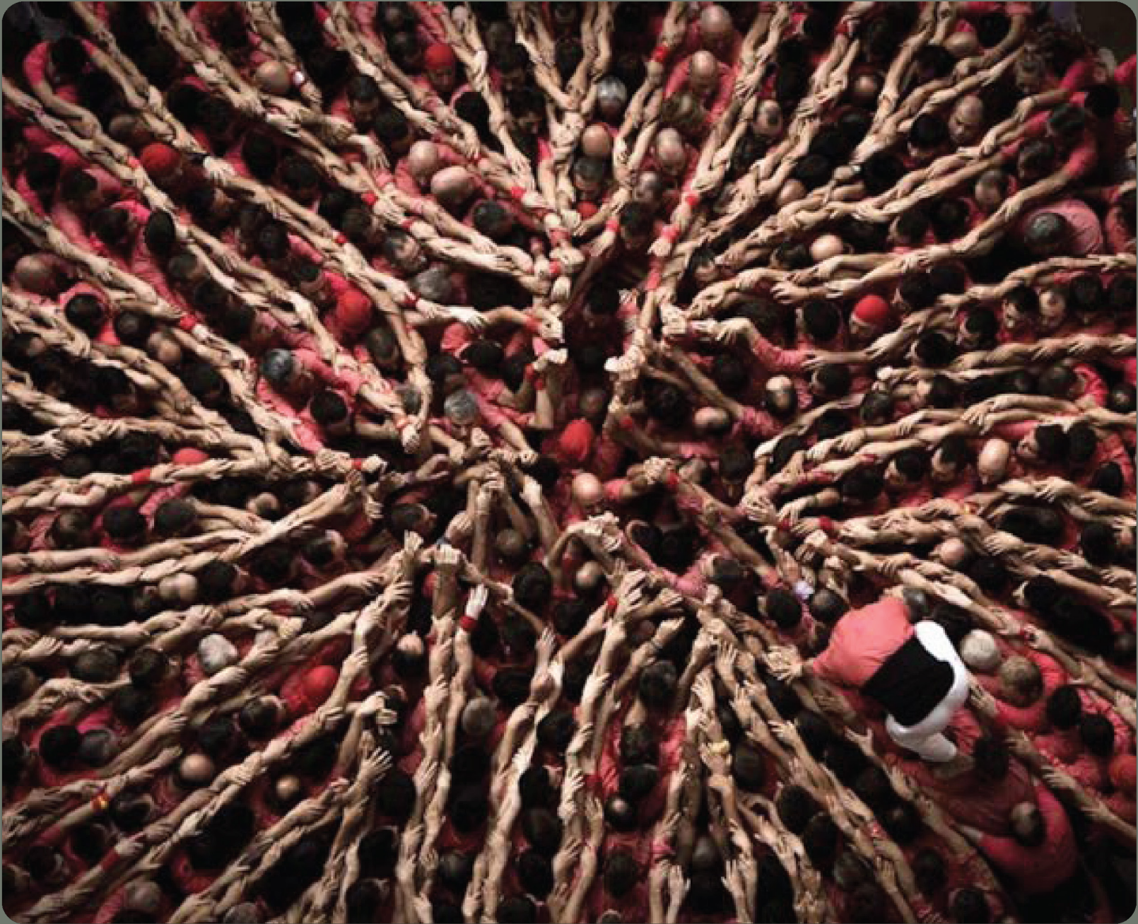
COLLABORATION Our way of ACTING