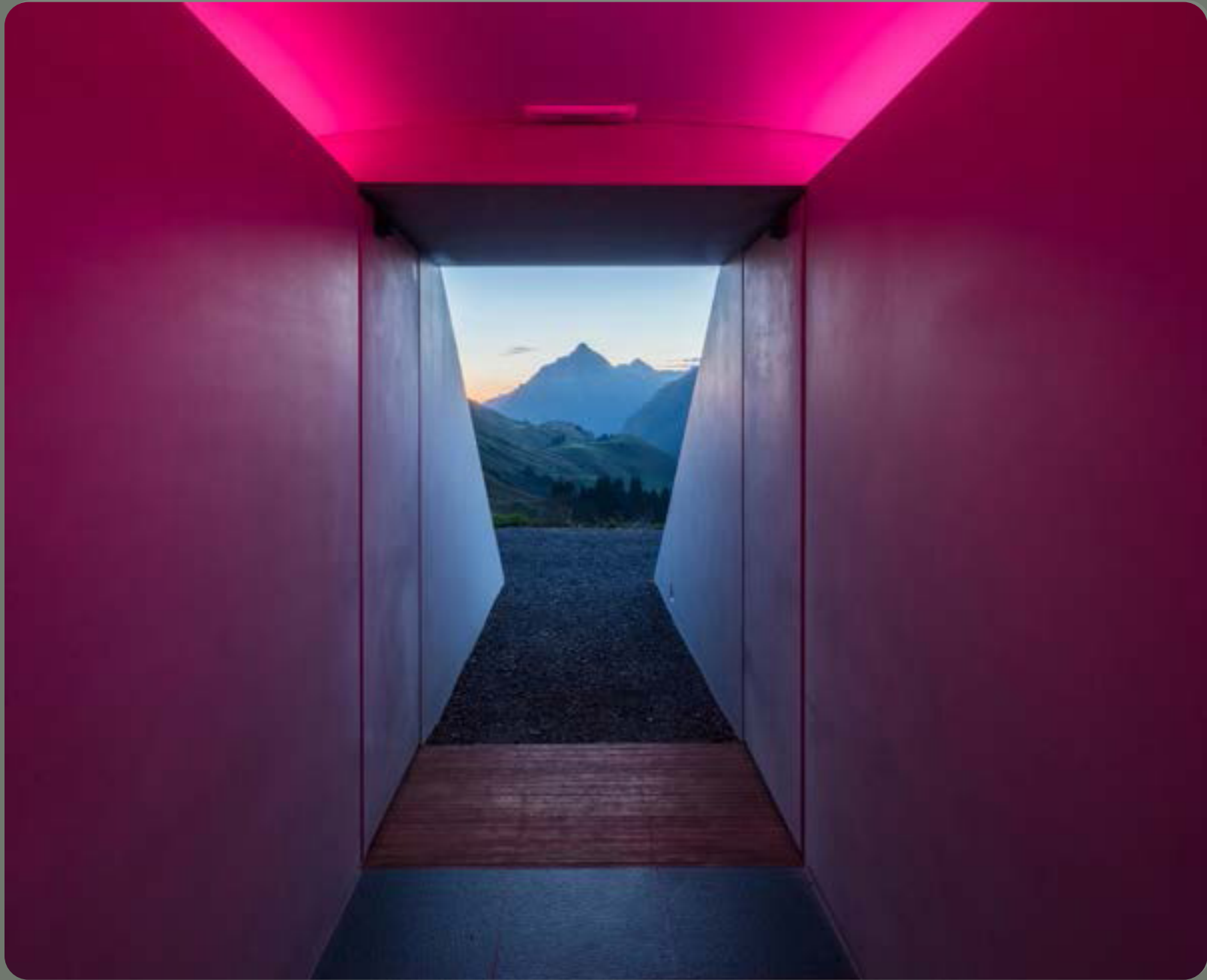
REGENERATION Our way of IMAGINING