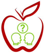
Tailored Professional Learning Inquiries

Project ARC's weekly course is structured for up to 15 teachers who follow a common schedule: discussion boards, formative assessments, and weekly assignments. Data gathered throughout the week is used to craft a personalized video for course participants. At the conclusion of the course, teachers have a fully-designed APLE ready to implement in their classroom.