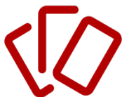
Formative Assessment Cards

Project ARC offers tailored, virtual sessions to meet the needs of individual teachers or small teams working to make their projects more authentic and relevant. These sessions can include looking-at-student-work protocols, support for the development of new APLEs, and facilitation support for APLE implementation. ViTAL Coaching is also offered for administrative teams and teacher leaders.