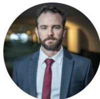
Dario Durigan Deputy Minister of Finance Brazil