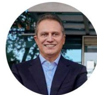
Gilberto Tomazoni Global CEO JBS