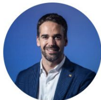
Eduardo Leite Governor Rio Grande do Sul