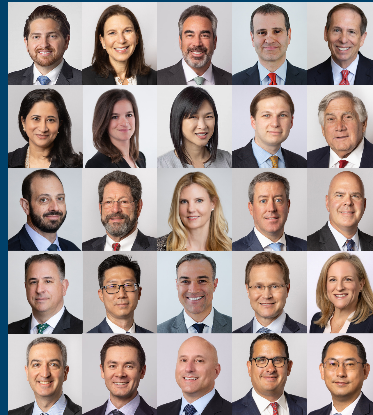
MANAGING DIRECTORS (Average tenure 18+ years)

We have amassed the best collection of talent in the industry, with very low turnover, which ensures engaged and stable client teams for long-term partnerships with our clients.