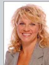
Sherri Coale Oklahoma