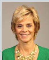
Kim Mulkey Baylor