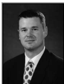
MIKE GREEN MEDIA RELATIONS CONTACT