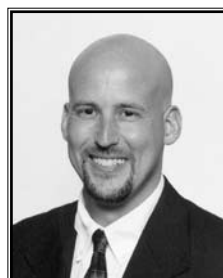
ANDREW GREEN MEDIA RELATIONS CONTACT