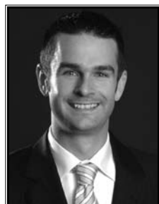
DAVE REITER MEDIA RELATIONS CONTACT