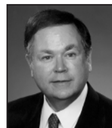
David L. Boren President