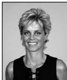
Head Coach Kim Mulkey (Louisiana Tech, 1984)