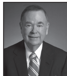
David L. Boren President