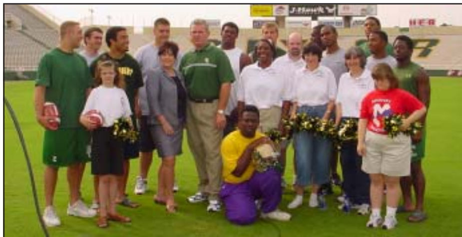
Coaches and student-athletes from throughout the Big 12 Conference take pride in working with Special Olympics.

The chances to create dialogue, friendship and hugs among the Special Olympians and interested groups from Big 12 schools have brought both groups ample satisfaction.