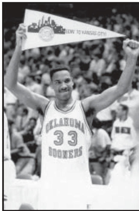
Oklahoma's Stacey King