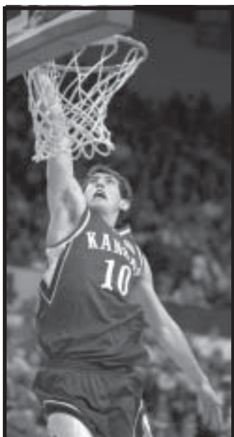
Kansas' Kirk Hinrich