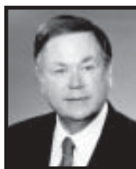
David L. Boren President