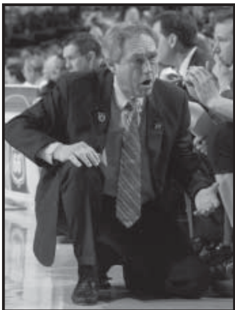
Last year Oklahoma State coach Eddie Sutton led the Cowboys to the Final Four and both the Big 12 regular season and tournament championships.