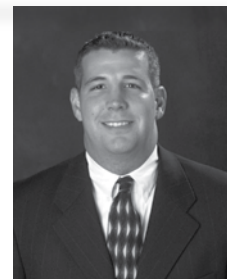
SCOTT MCCONNELL MEDIA RELATIONS CONTACT