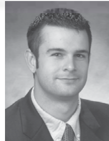
DAVE REITER MEDIA RELATIONS CONTACT