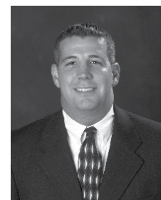
SCOTT MCCONNELL MEDIA RELATIONS CONTACT