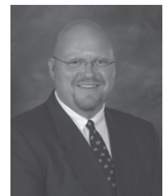
MIKE NOTEWARE MEDIA RELATIONS CONTACT