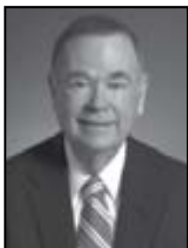
DAVID L. BOREN PRESIDENT