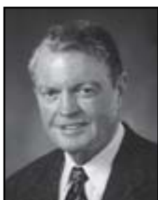
TOM OSBORNE DIRECTOR OF ATHLETICS