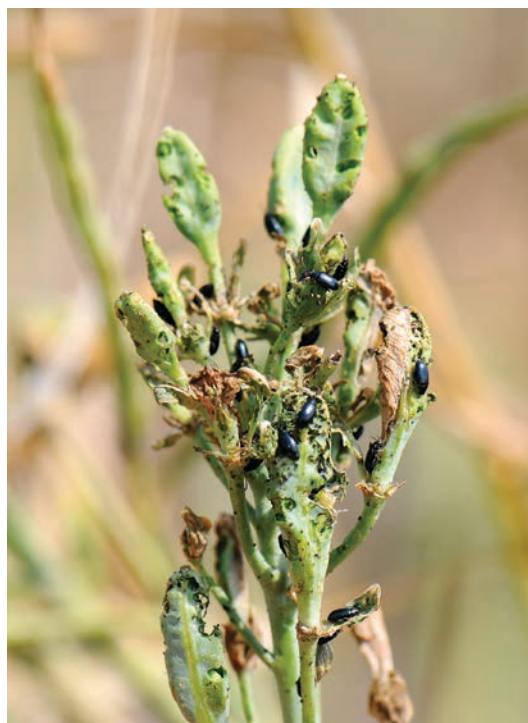
Fig. 1.3. Feeding on seed pods of canola in late summer by new generation of Phyllotreta flea beetles.

The new generation of adult Phyllotreta flea beetles emerges from puparia beginning in August and emergence continues through September in northern North America (Ulmer and Dossdall, 2006). Ulmer and Dossdall (2006) found that the sex ratio of P. cruciferae for the new generation was 1.2 females to one male. Beetles feed on the epidermis of green foliage and pods (Fig. 1.3); however,