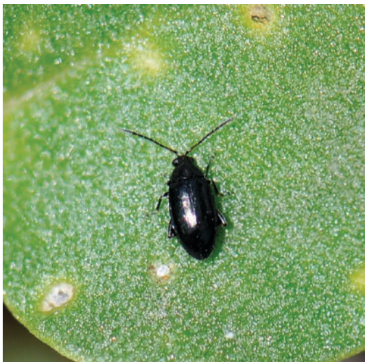
Fig. 1.1. Adult crucifer flea beetle ( Phyllotreta cruciferae (Goeze)).

Adults of Phyllotreta species feed and reproduce for about 10–12 weeks (Burgess, 1977a; Wylie,