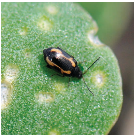
Fig. 1.2. Adult striped flea beetle ( Phyllotreta striolata (Fabricius)).

1979; Ulmer and Dossdall, 2006). Females oviposit in the soil during June and deposit up to 25 eggs per female; eggs are deposited singly or in groups of three or four on the roots of host plants (Westdal and Romanow, 1972). Eggs are oval, yellow and about 0.38–0.46 mm long by 0.18–0.25 mm wide. Larvae hatch from the eggs in about 12 days and feed on the secondary roots of the plant. Larvae are small (approximately 3 mm), whitish, slender, cylindrical worms with tiny legs and a brown head and anal plate. Larvae progress through three instars over a period of 25–34 days and then form an earthen puparium. Pupae are white except for the black eyes. The pupal stage lasts for about 7–9 days.