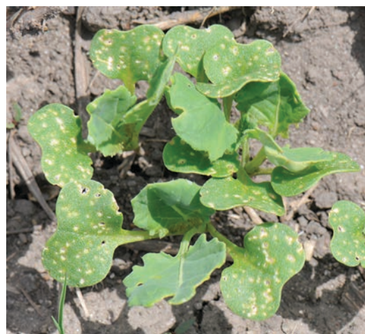
Fig. 1.4. Canola seedling damaged by Phyllotreta flea beetles feeding on cotyledons (note pitting and shot holing).

The greatest crop loss from this pest occurs in the seedling stage within the first 2 weeks after plant emergence (Turnock and Lamb, 1982; Lamb, 1984; Bracken and Bucher, 1986). Adult feeding on cotyledons causes the tissue to die around the feeding sites, creating a shot-hole appearance and necrosis on seedlings (Fig. 1.4). Feeding injury is often concentrated on one cotyledon only, since P. cruciferae tend to aggregate during feeding (Anderson et al. , 1992). As a result of herbivory by Phyllotreta , the plant's ability to conduct photosynthesis is negatively affected, often causing wilting and seedling death (Westdal and Romanow, 1972). Damage from Phyllotreta herbivory on seedlings results in reduced crop stands, causing lower seed yield and quality, and uneven plant growth, causing delayed maturity (Putnam, 1977; Lamb and Turnock, 1982; Lamb, 1984; Weiss et al. , 1991). Fields may need to be reseeded when canola stands are below 43 plants/m 2 (Kandel and Knodel, 2011). Gavloski and Lamb (2000) found that compensation by canola seedlings from