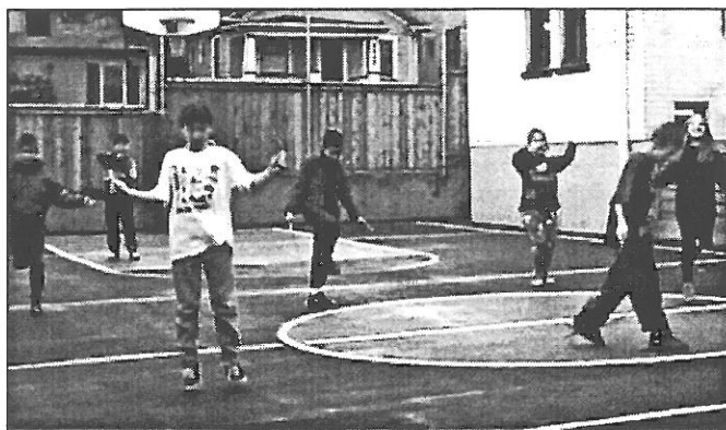
Bertschi School Students Jump for Joy!