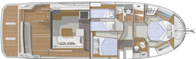
Lower deck / 2 Heads 3 Cabins