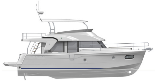
Profile - FLY