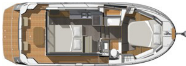
1 cabin - Separate shower