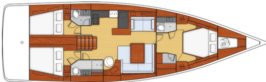
3 cabins + 3 heads + Forepeak cabin (Option)