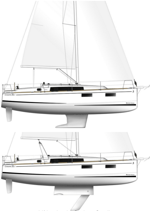
Lifting keel - Option: Cradle