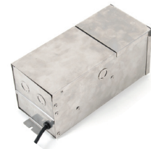
9600-TRN-SS 600W Max

waclighting.com Phone (800) 526.2588 Fax (800) 526.2585