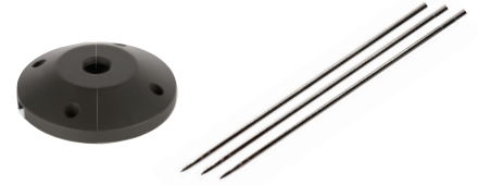
Includes three 7 inch threaded stainless steel stabilizing pins for ground mounting or surface mounts with four screws or over a junction box