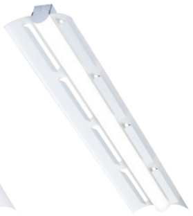
LED Surface Ambient Luminaire with Apertured Reflectors: • LS4-AR 4-foot • LS8-AR 8-foot