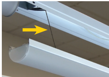
Suspension cable allows lens to hang hands-free during wiring