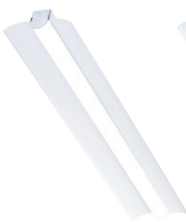
LED Surface Ambient Luminaire with Solid Reflectors: • LS4-SR 4-foot • LS8-SR 8-foot