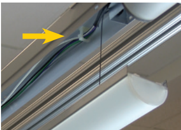
Simplified wire management