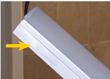
Pull tabs for easy lens removal