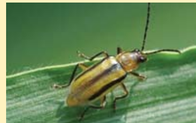
Adult Western Corn Rootworm