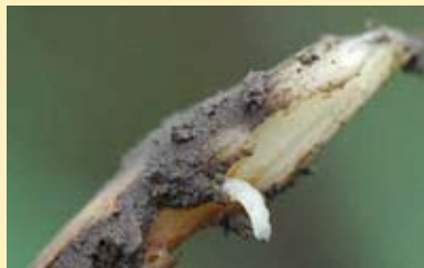
Corn Rootworm Larvae Burrowing in Root Tip