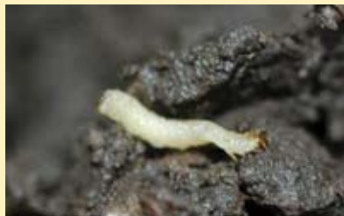
Corn Rootworm Larvae in Soil