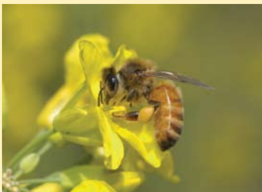
Honeybee, Apis mellifera

Field studies have been conducted annually since 2001 to determine the impact of DAS-59122-7 maize on natural non-target arthropod populations. The results were compared with non-transgenic maize as well as conventional insecticides used for rootworm control. To date, no adverse effects have been observed when comparing the abundance of non-target organisms in DAS-59122-7 field plots compared to non-transgenic maize field plots.