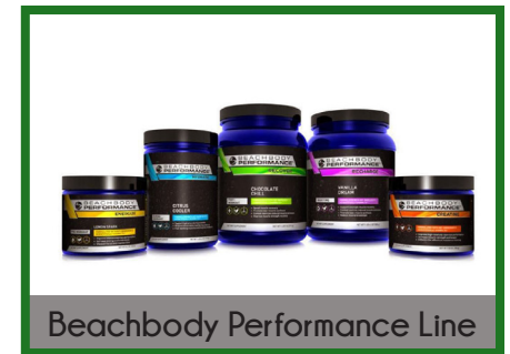
Beachbody Performance Line