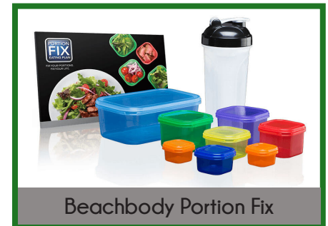
Beachbody Portion Fix