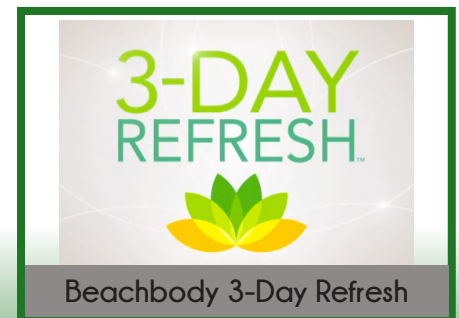
Beachbody 3-Day Refresh