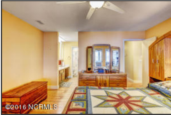
951 Chadwick Shores Dr Sneads-large-015-