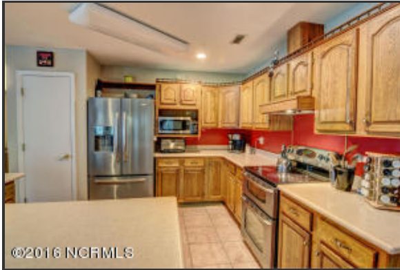
951 Chadwick Shores Dr Sneads-large-009-