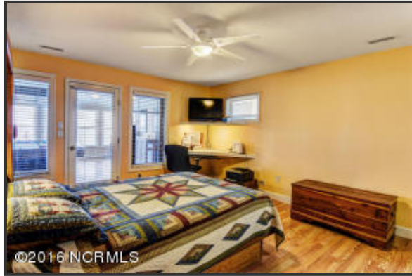
951 Chadwick Shores Dr Sneads-large-016-