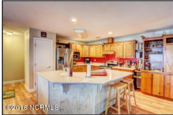
951 Chadwick Shores Dr Sneads-large-010-