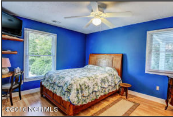
951 Chadwick Shores Dr Sneads-large-021-