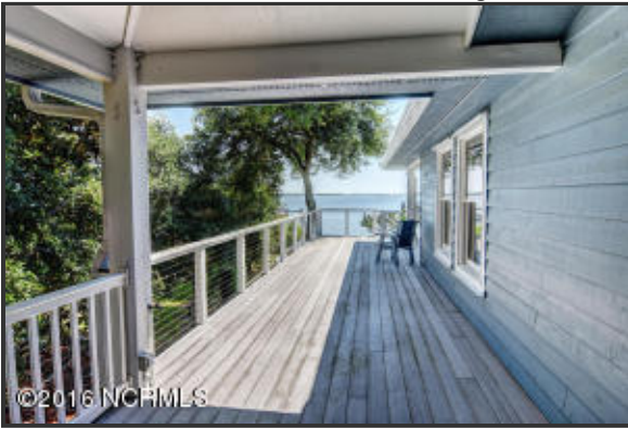
951 Chadwick Shores Dr Sneads-large-025-