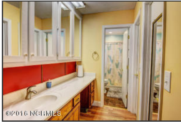
951 Chadwick Shores Dr Sneads-large-014-