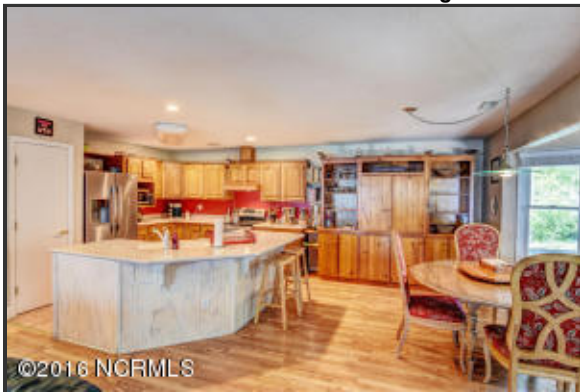
951 Chadwick Shores Dr Sneads-large-011-