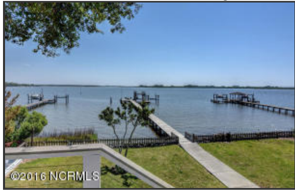
951 Chadwick Shores Dr Sneads-large-026-