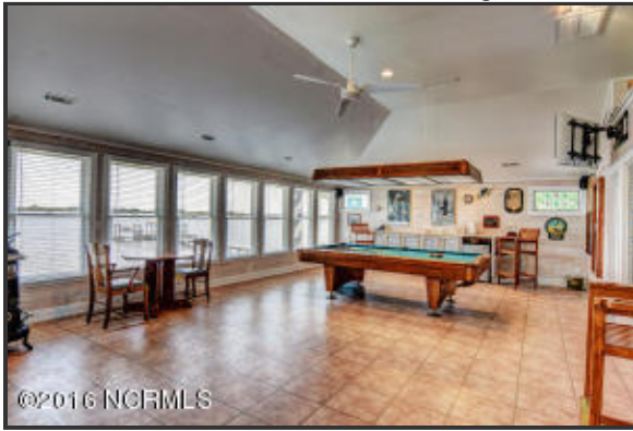
951 Chadwick Shores Dr Sneads-large-007-