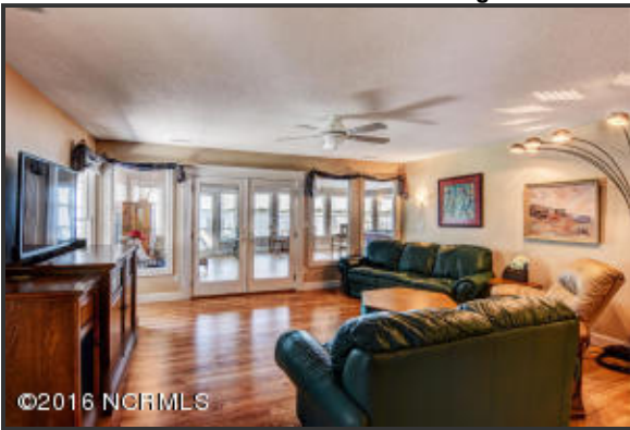
951 Chadwick Shores Dr Sneads-large-005-