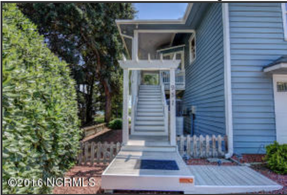
951 Chadwick Shores Dr Sneads-large-003-