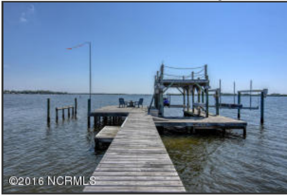
951 Chadwick Shores Dr Sneads-large-031-