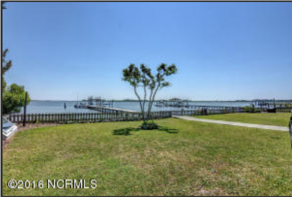
951 Chadwick Shores Dr Sneads-large-027-