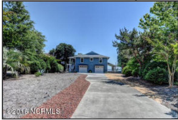
951 Chadwick Shores Dr Sneads-large-002-