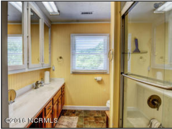
951 Chadwick Shores Dr Sneads-large-019-