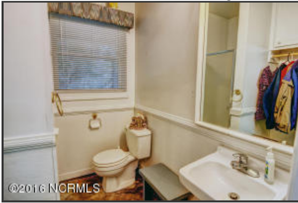
951 Chadwick Shores Dr Sneads-large-013-