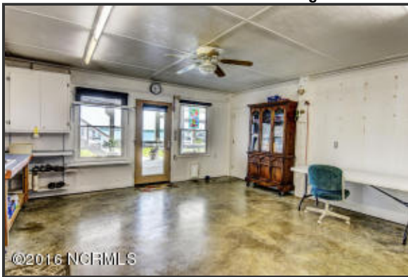
951 Chadwick Shores Dr Sneads-large-023-