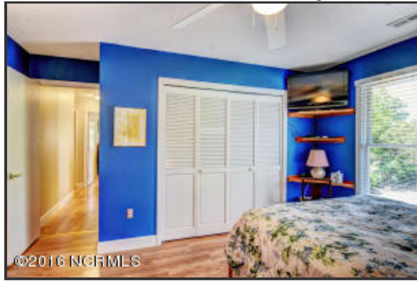
951 Chadwick Shores Dr Sneads-large-020-