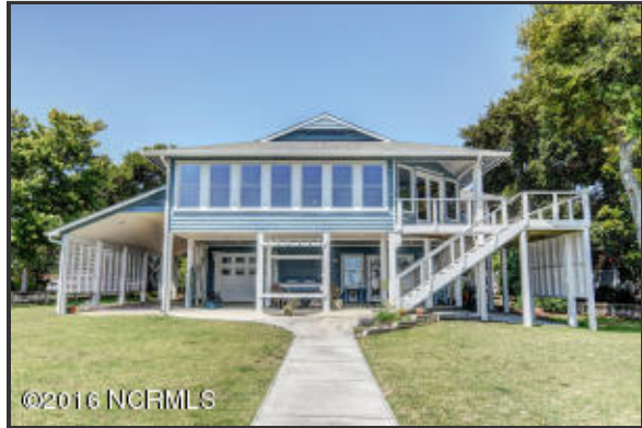
951 Chadwick Shores Dr Sneads-large-028-