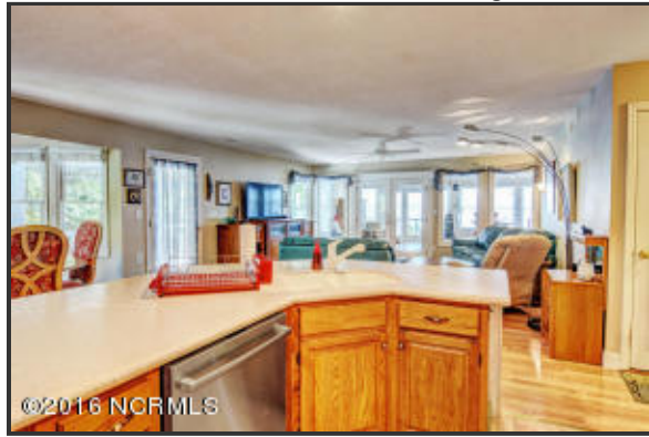
951 Chadwick Shores Dr Sneads-large-008-