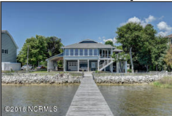
951 Chadwick Shores Dr Sneads-large-029-