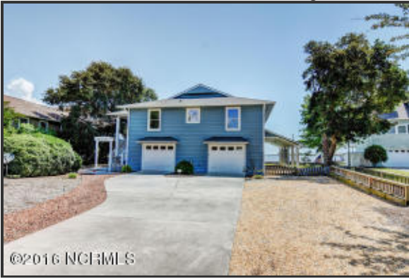
951 Chadwick Shores Dr Sneads-large-001-