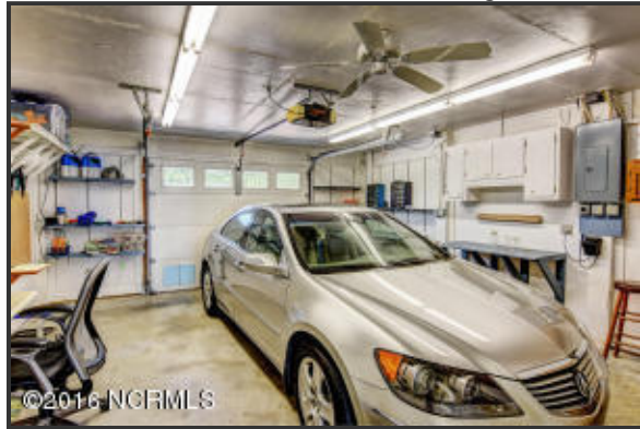
951 Chadwick Shores Dr Sneads-large-022-