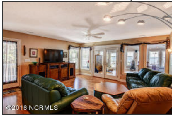
951 Chadwick Shores Dr Sneads-large-004-