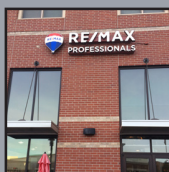
DENVER TECH CENTER