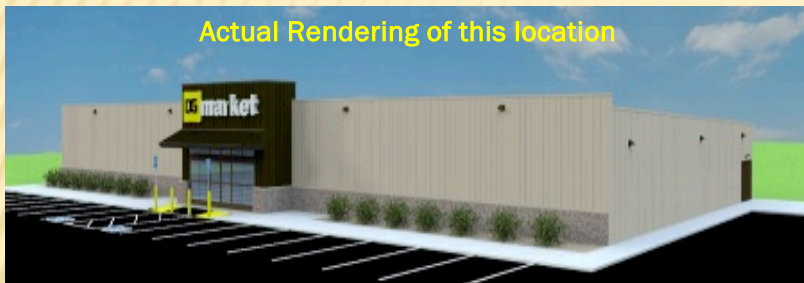
Actual Rendering of this location