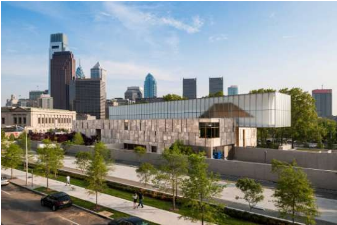
1. View from Pennsylvania Avenue. The Barnes Foundation, Philadelphia. (March 2012)