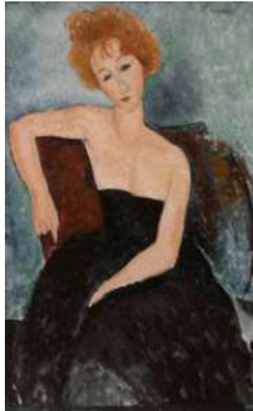
25. Amedeo Modigliani, Italian, 1884–1920. Redheaded Girl in Evening Dress (Jeune fille rousse en robe de soir) , 1918. Oil on canvas, 45 3/4 x 28 3/4 in. (116.2 x 73 cm). BF206