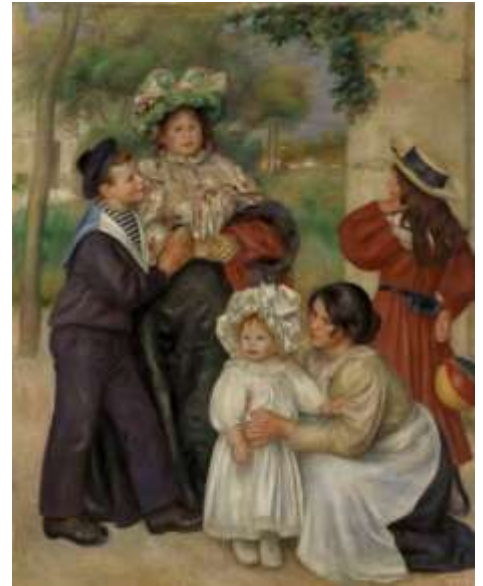
26. Pierre-Auguste Renoir, French, 1841–1919. The Artist's Family (La Famille de l'artiste) , 1896. Oil on canvas, 68 1/8 x 54 in. (173 x 137.2 cm). BF819