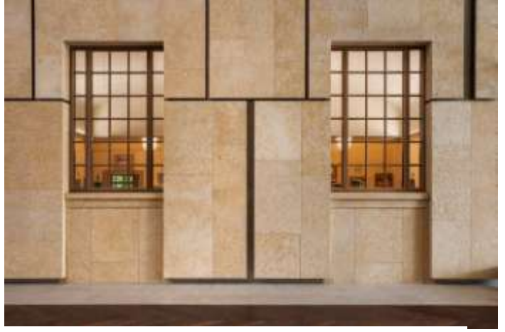
9. View of the Light Court, looking into the Collection Gallery. The Barnes Foundation, Philadelphia.