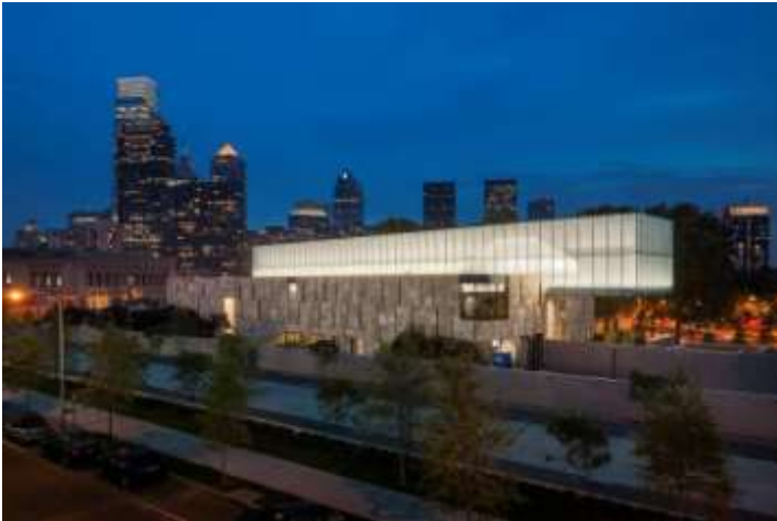
5. Looking south east. The Barnes Foundation Philadelphia.