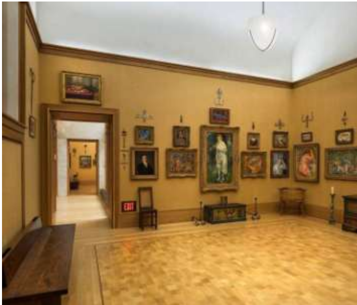
15. Room 6, east wall. The Barnes Foundation, Philadelphia.