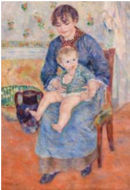
31. Pierre-Auguste Renoir, French, 1841–1919. Young Mother (Jeune mère) , 1881. Oil on canvas, 47 3/4 x 33 3/4 in. (121.3 x 85.7 cm). BF15.