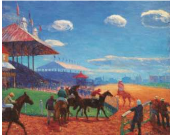
28. William James Glackens, American, 1870–1938. Race Track , 1908–1909. Oil on canvas, 26 1/8 x 32 1/4 in. (66.4 x 81.9 cm). BF138.