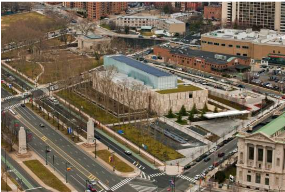
2. Aerial view from the Benjamin Franklin Parkway and 20 th Street. The Barnes Foundation, Philadelphia. (March 2012)

Additional images and hi-resolution images are available online at press.barnesfoundation.org