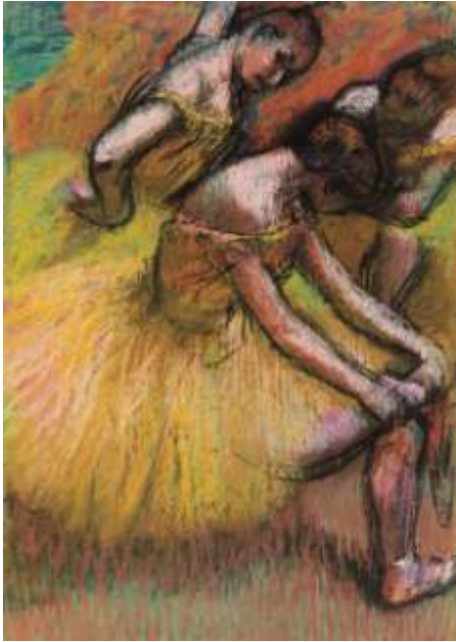
27. Edgar Degas, French, 1834–1917. Group of Dancers (Groupe de danseuses) , c. 1900. Oil pastel on paper, 22 3/4 x 16 1/8 in. (57.8 x 41 cm). BF121.