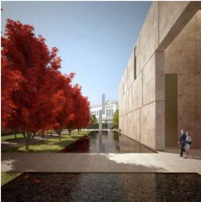
19. Rendering of the entry plaza. The Barnes Foundation, Philadelphia. View of The Barnes Totem , 2012 by Ellsworth Kelly. Bead-blasted stainless steel, 40' x 80" x 20". Made possible through the generosity of The Neubauer Family Foundation