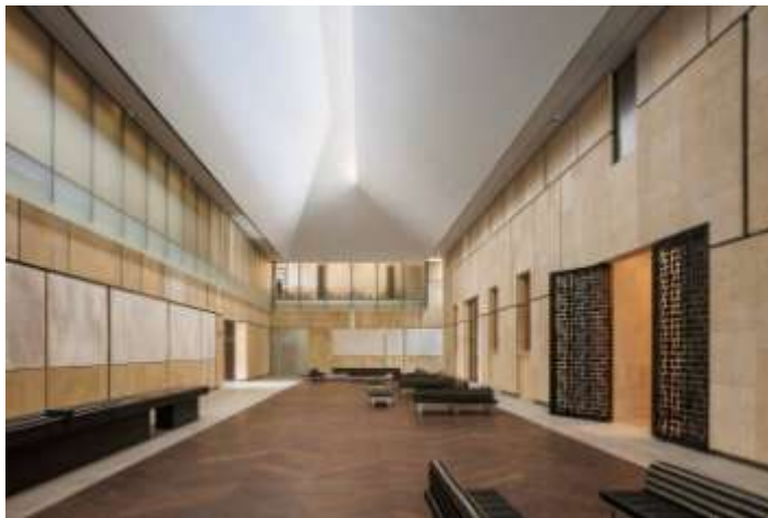
6. View of the Light Court, looking east. The Barnes Foundation, Philadelphia.