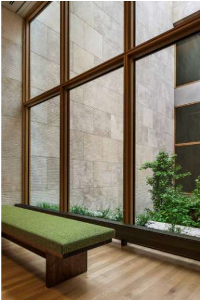
10. Looking into the Gallery Garden. The Barnes Foundation, Philadelphia.