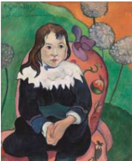
29. Paul Gauguin, French, 1848–1903. Mr. Loulou (Louis Le Ray) , 1890. Oil on canvas, 21 3/4 x 18 1/4 in. (55.2 x 46.4 cm). BF589.