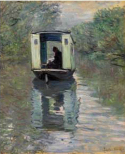
24. Claude Monet, French, 1840–1926. The Studio Boat (Le Bateau-atelier) , 1876. Oil on canvas, 28 5/8 x 23 5/8 in. (72.7 x 60 cm). BF730