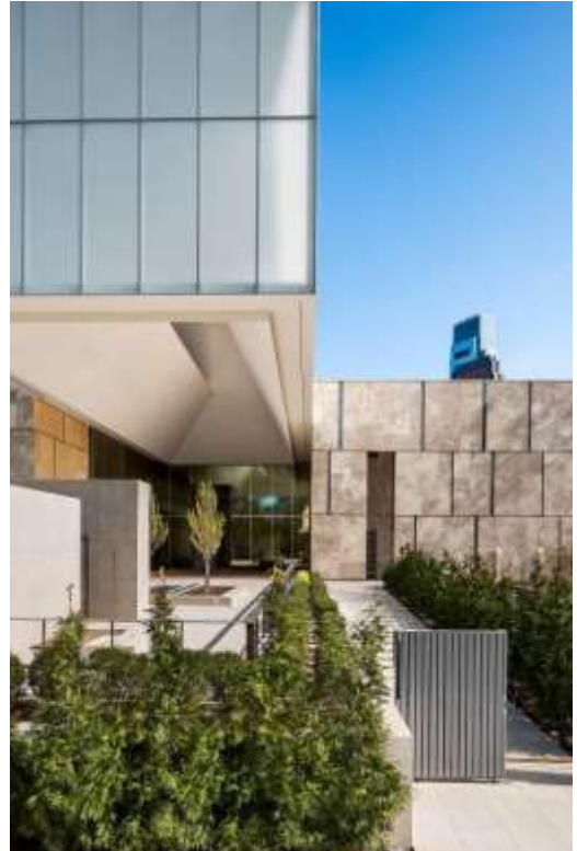
4. View from 21 st Street. The Barnes Foundation, Philadelphia. (March 2012)