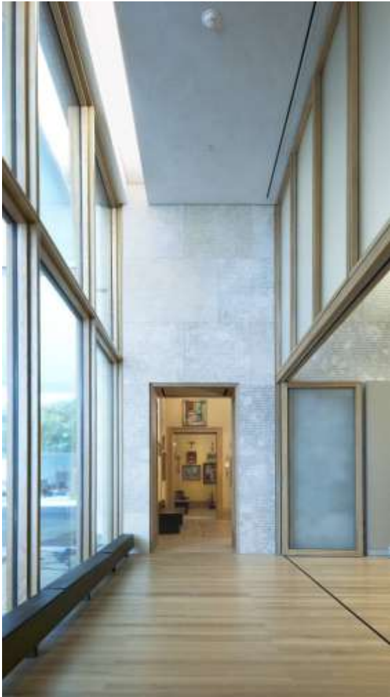
13. Looking east through Room 9 to Room 8. The Barnes Foundation, Philadelphia.