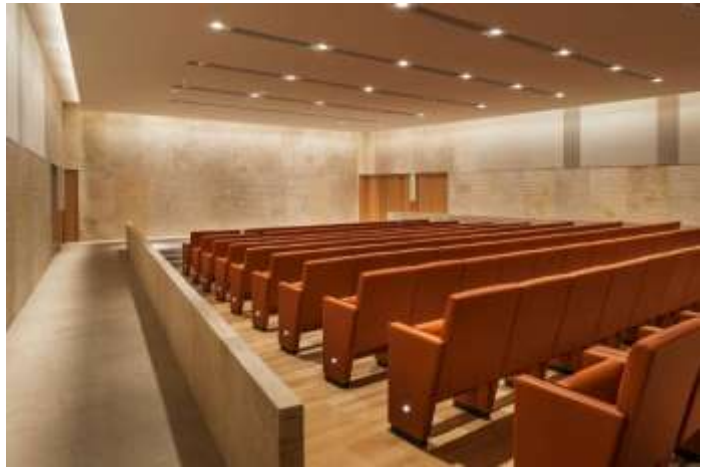
11. View of the Auditorium. The Barnes Foundation, Philadelphia.