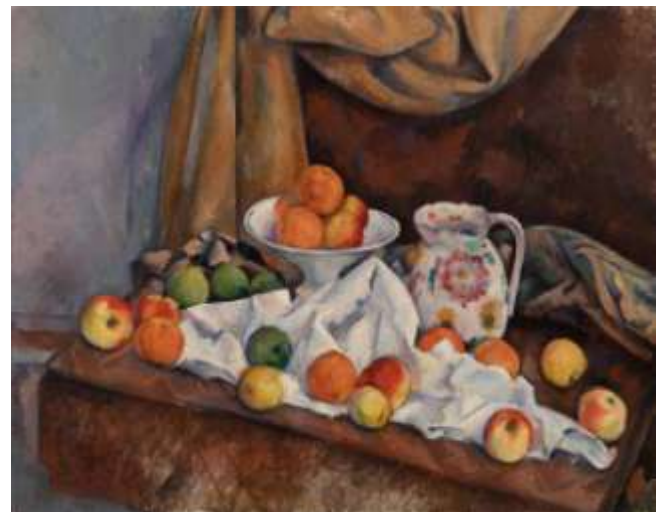
30. Paul Cézanne, French, 1839–1906. Still Life (Nature morte) , 1892–1894. Oil on canvas, 28 3/4 x 36 3/8 in. (73 x 92.4 cm). BF910.