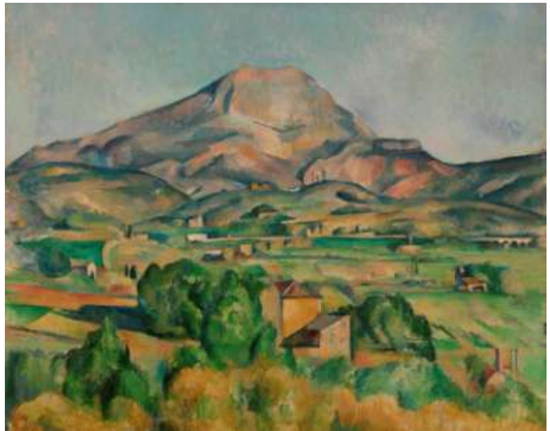
32. Paul Cézanne, French, 1839–1906. Mont Sainte-Victoire (La Montagne Sainte-Victoire) , 1892–1895. Oil on canvas, 28 3/4 x 36 1/4 in. (73 x 92 cm). BF13.