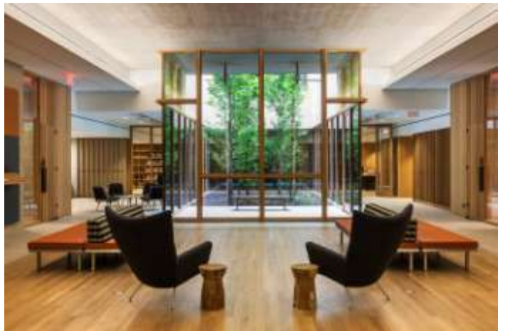
12. Lower Lobby, looking into the Gallery Garden and Library. The Barnes Foundation, Philadelphia.