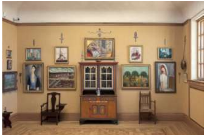
18. Room 18, east wall. The Barnes Foundation, Philadelphia.