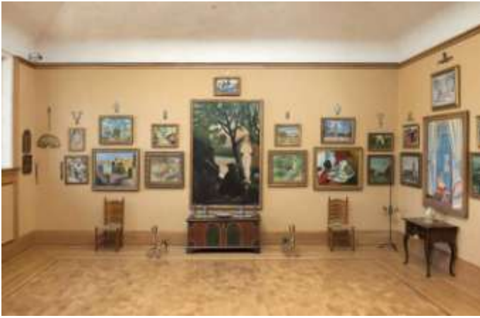
17. Room 23, west wall. The Barnes Foundation, Philadelphia.