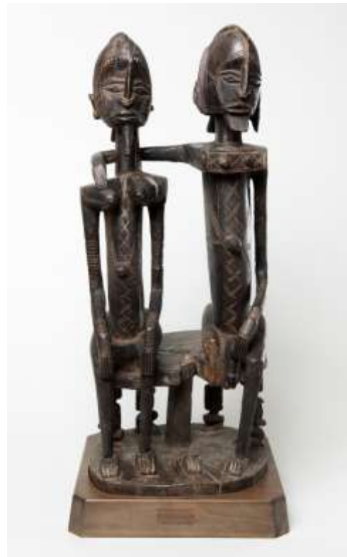
34. Seated Couple , late 19th–early 20th century. Dogon peoples, Mali. Wood, 25 3/8 x 9 3/4 x 9 1/8 in. (64.5 x 24.8 x 23.2 cm). A197.