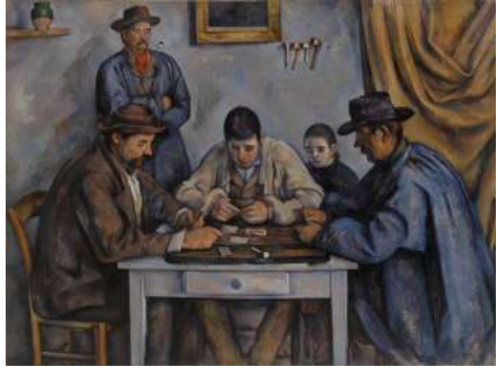
23. Paul Cézanne, French, 1839–1906. The Card Players (Les Joueurs de cartes) , 1890–1892. Oil on canvas, 53 1/4 x 71 5/8 in. (135.3 x 181.9 cm). BF564