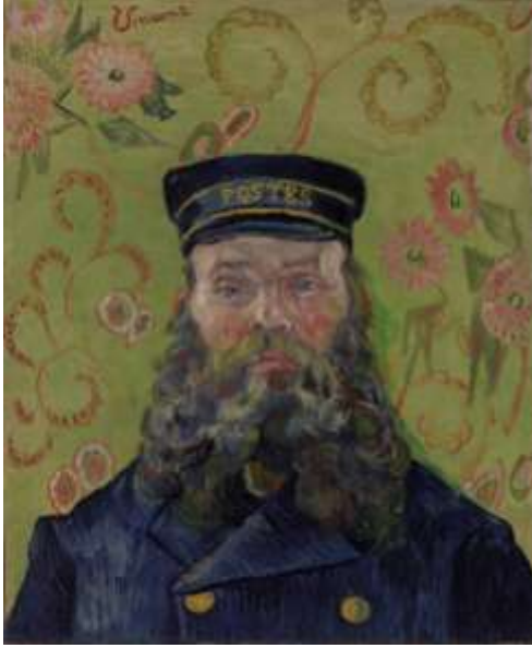
22. Vincent van Gogh, Dutch, 1853–1890. The Postman (Joseph-Étienne Roulin) , 1889. Oil on canvas, 25 7/8 x 21 3/4 in. (65.7 x 55.2 cm). BF37