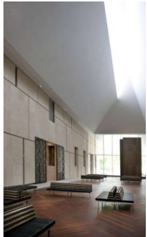
7. View of the Light Court, looking west. The Barnes Foundation, Philadelphia.

Additional images and hi-resolution images are available online at press.barnesfoundation.org