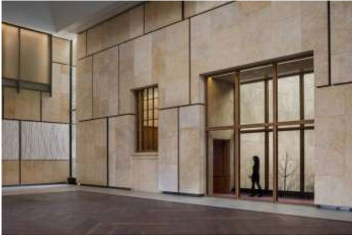
8. View of Gallery Garden and Collection Gallery from Court. The Barnes Foundation, Philadelphia. (March 2012)