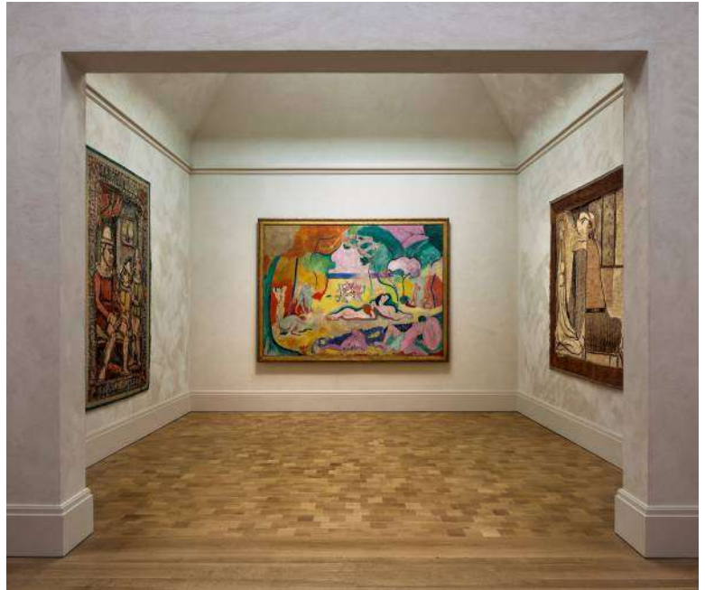
14. Le Bonheur de Vivre Room. The Barnes Foundation, Philadelphia.