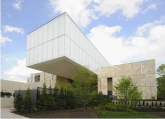
3. View from 21st Street. The Barnes Foundation, Philadelphia.