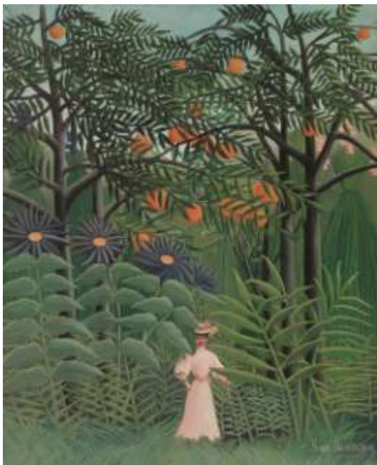
33. Henri Rousseau, French, 1844–1910. Woman Walking in an Exotic Forest (Femme se promenant dans un forêt exotique) , 1905. Oil on canvas, 39 3/8 x 31 3/4 in. (100 x 80.6 cm). BF388.