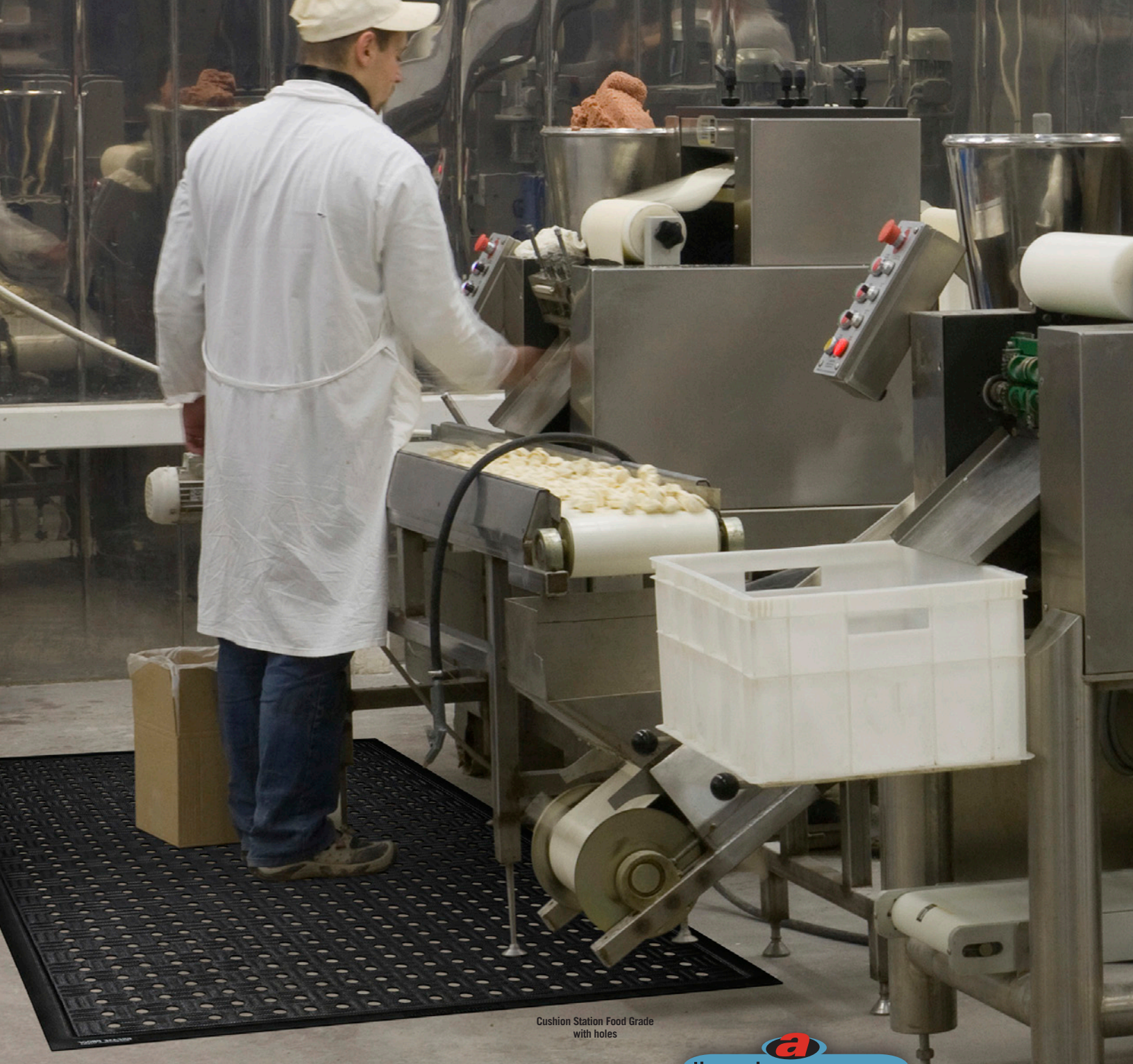
Cushion Station Food Grade with holes

ANTI-FATIGUE/DRY OR WET ENVIRONMENTS/INDOOR