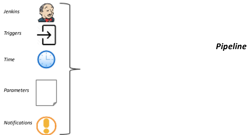
Figure 1: Deployment management with Spinnaker