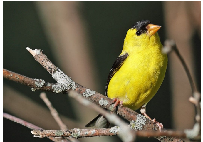
Figure 2. Although currently found at the Site, suitable climate for the American Goldfinch ( Spinus tristis ) may cease to occur here in summer by 2050, potentially resulting in local seasonal extirpation.

sensitive species, one, the Brown Creeper ( Certhia americana ), might be extirpated from the Site in summer by 2050.