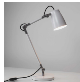
CODE: 1224005 FINISH: MATT WHITE