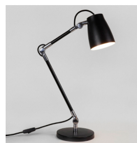
CODE: 1224006 FINISH: MATT BLACK

TO MAINTAIN THIS PRODUCT TO ITS BEST CONDITION, PLEASE VIEW OUR CARE AND CLEANING GUIDE ON THE SUPPORT SECTION OF THE ASTRO WEBSITE.