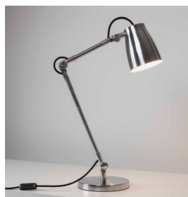
CODE: 1224004 FINISH: POLISHED ALUMINIUM