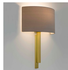
CODE: 1334006 (7304) FINISH: MATT GOLD