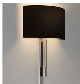
CODE: 1334005 (7303) FINISH: POLISHED CHROME