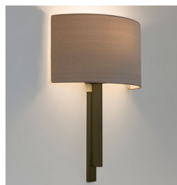
CODE: 1334008 (8253) FINISH: BRONZE

TO MAINTAIN THIS PRODUCT TO ITS BEST CONDITION, PLEASE VIEW OUR CARE AND CLEANING GUIDELINES ON THE SUPPORT SECTION OF THE ASTRO WEBSITE.