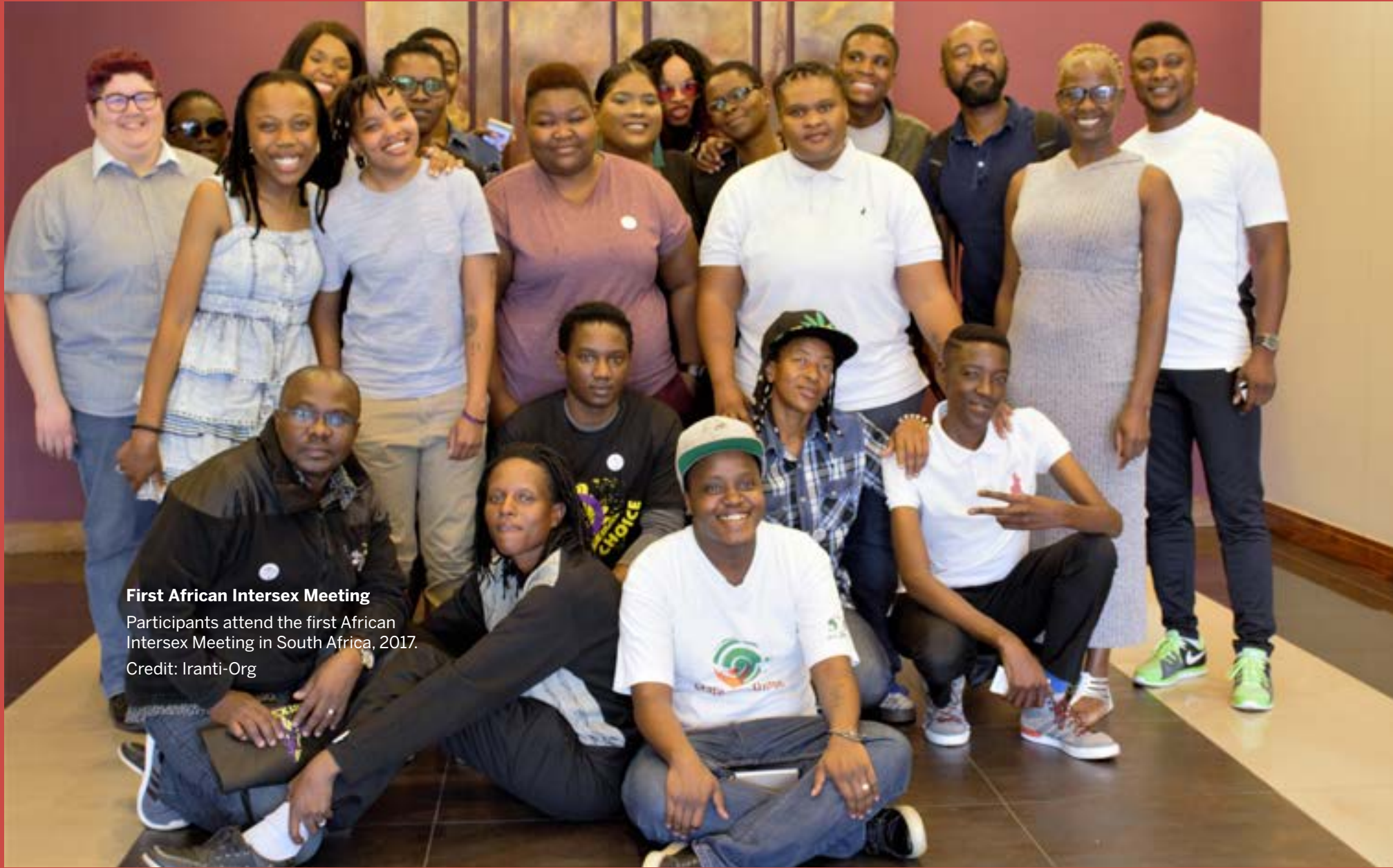
First African Intersex Meeting Participants attend the first African Intersex Meeting in South Africa, 2017.