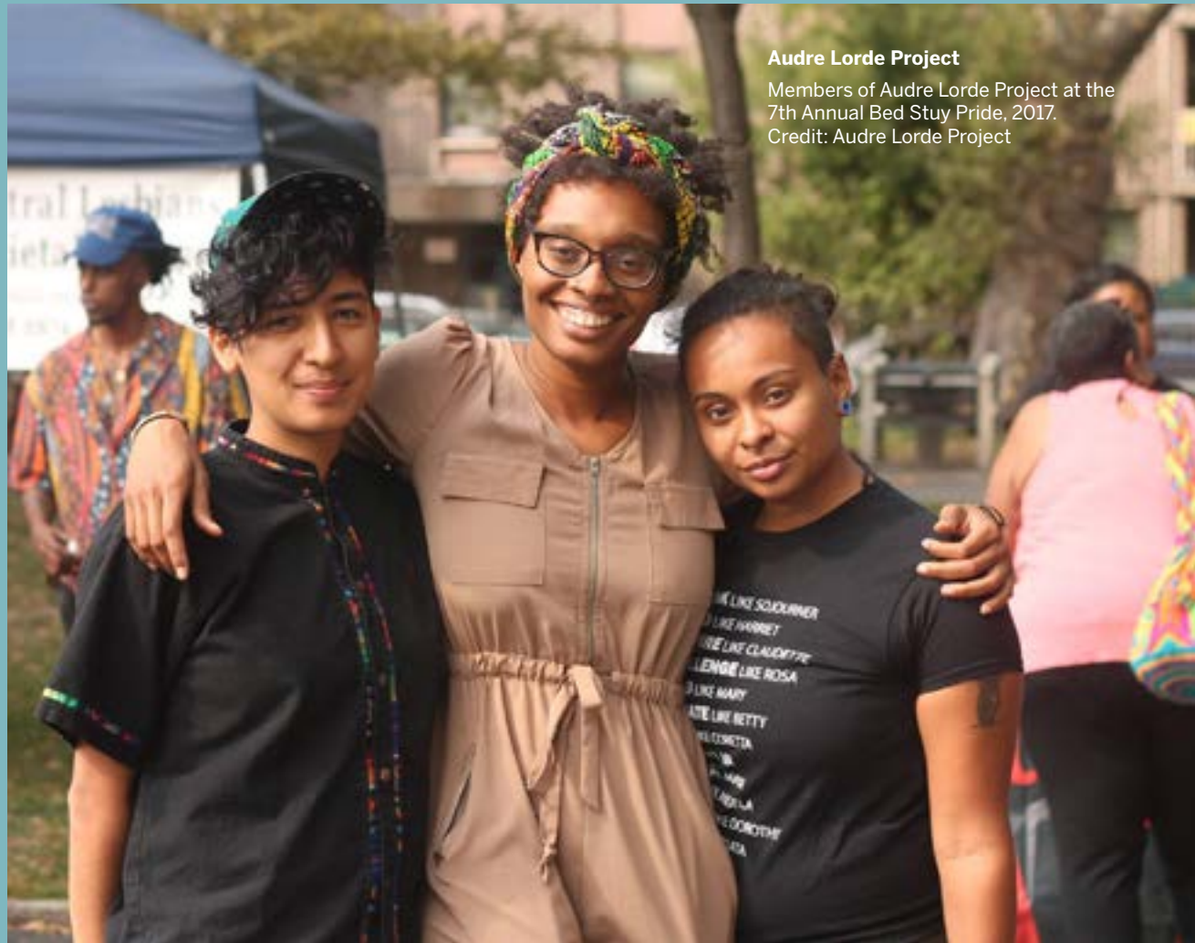
Audre Lorde Project

Members of Audre Lorde Project at the 7th Annual Bed Stuy Pride, 2017.