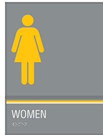
20 Dark Grey