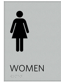
10 Steel Grey