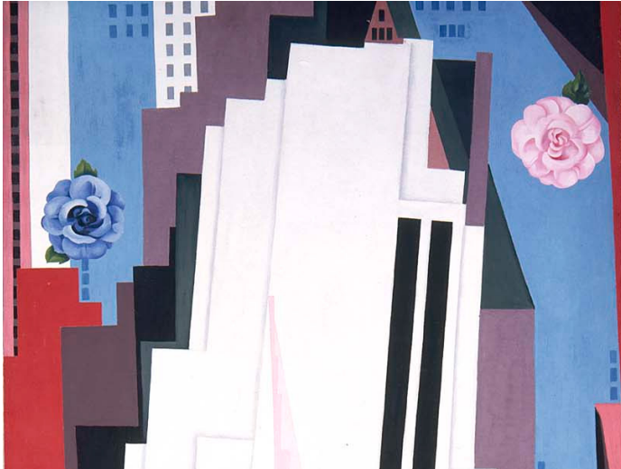
Georgia O'Keeffe, Manhattan [Detail], 1932, oil on canvas, 84 3/8 x 48 1/4 in., Gift of the Georgia O'Keeffe Foundation, 1995.3.1.

Many artworks in our collection support this videoconference. A representative sample appears below. Please note that images used during your videoconference may vary.