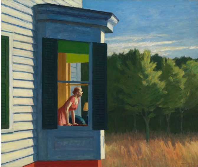
Edward Hopper, Cape Cod Morning , 1950, oil on canvas, 34 1/8 x 40 1/4 in., Gift of the Sara Roby Foundation, 1986.6.92.