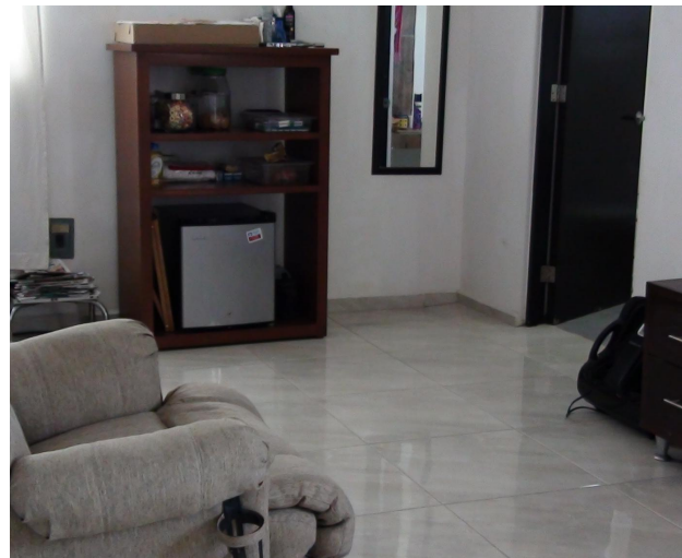
Recámara principal con baño y closet