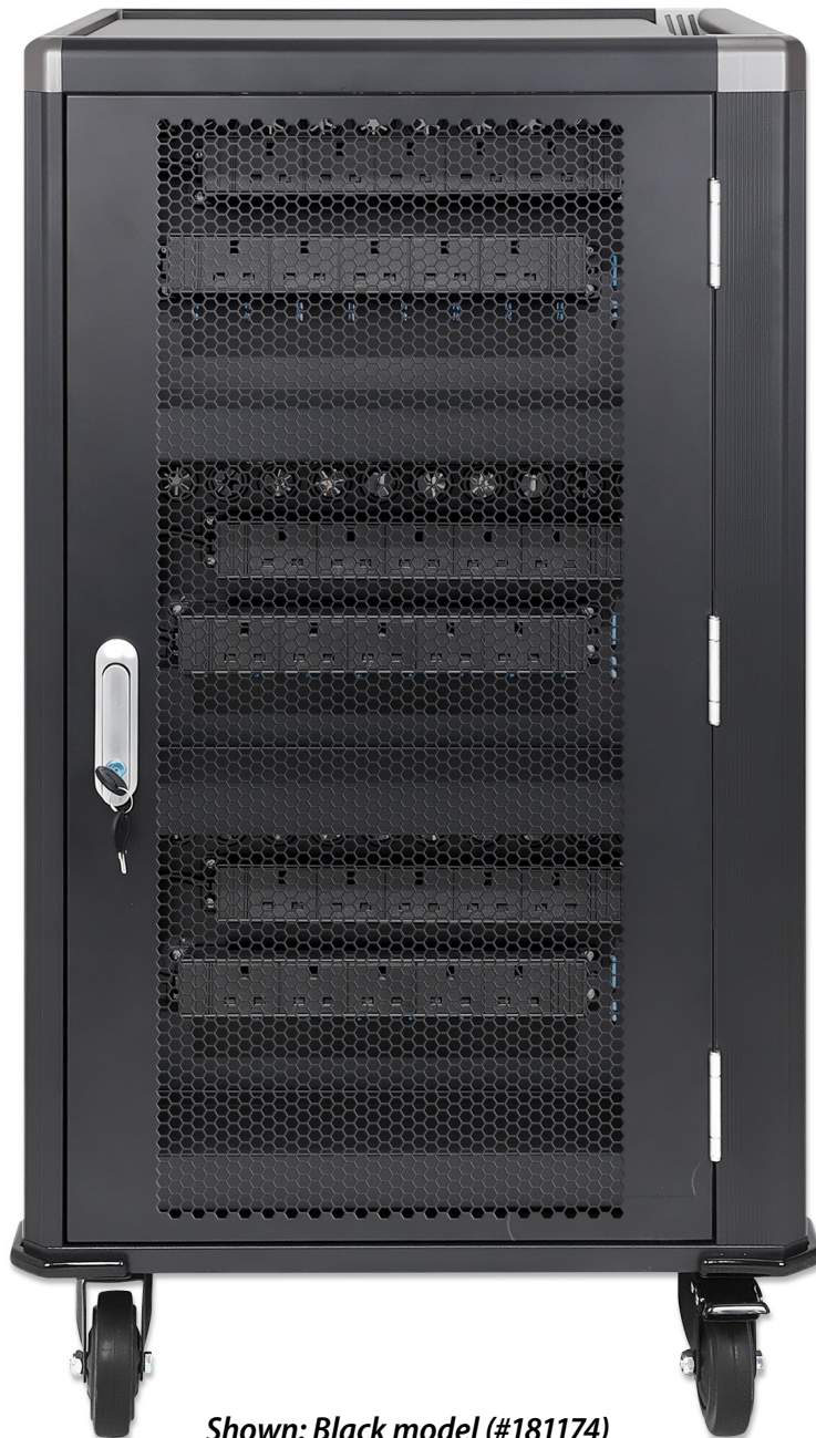
Shown: Black model (#181174)